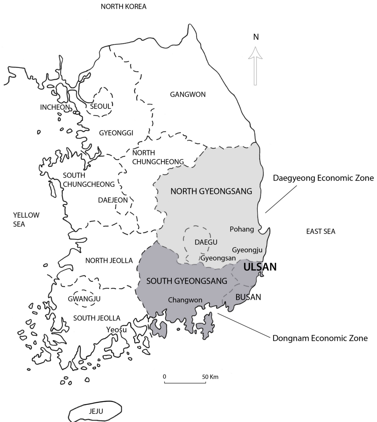
Fig. (1). Ulsan among South Korea's Provinces and Special Cities.

Ulsan Metropolitan City is situated along the East Sea, within South Korea's newly defined Dongnam (Southeast) Economic Zone and the larger Gyeongsang Region. As shown in Fig. (1), the latter also includes the Daegyeong