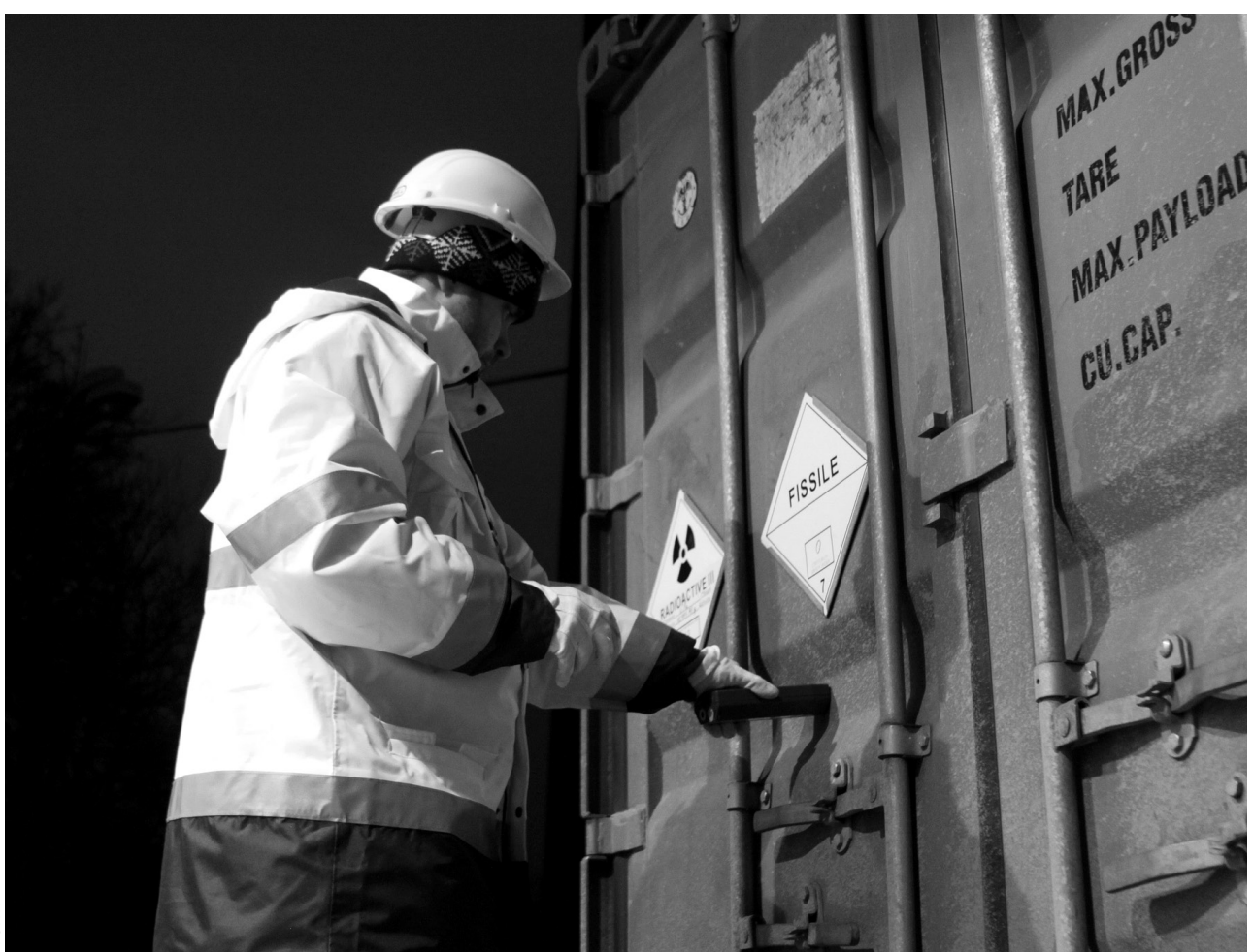
A worker checks for radiation as HEU is prepared for transport in the Czech Republic. In March 2013, the Czech Republic became the 10th country to eliminate its stockpiles of HEU since the four-year effort to secure nuclear materials worldwide was announced in April 2009.

• 9 countries hosted, requested, or are preparing for IAEA International Physical Protection Advisory Service (IPPAS) missions. Australia, the Republic of Korea, and the United States will receive IPPAS missions in 2013.