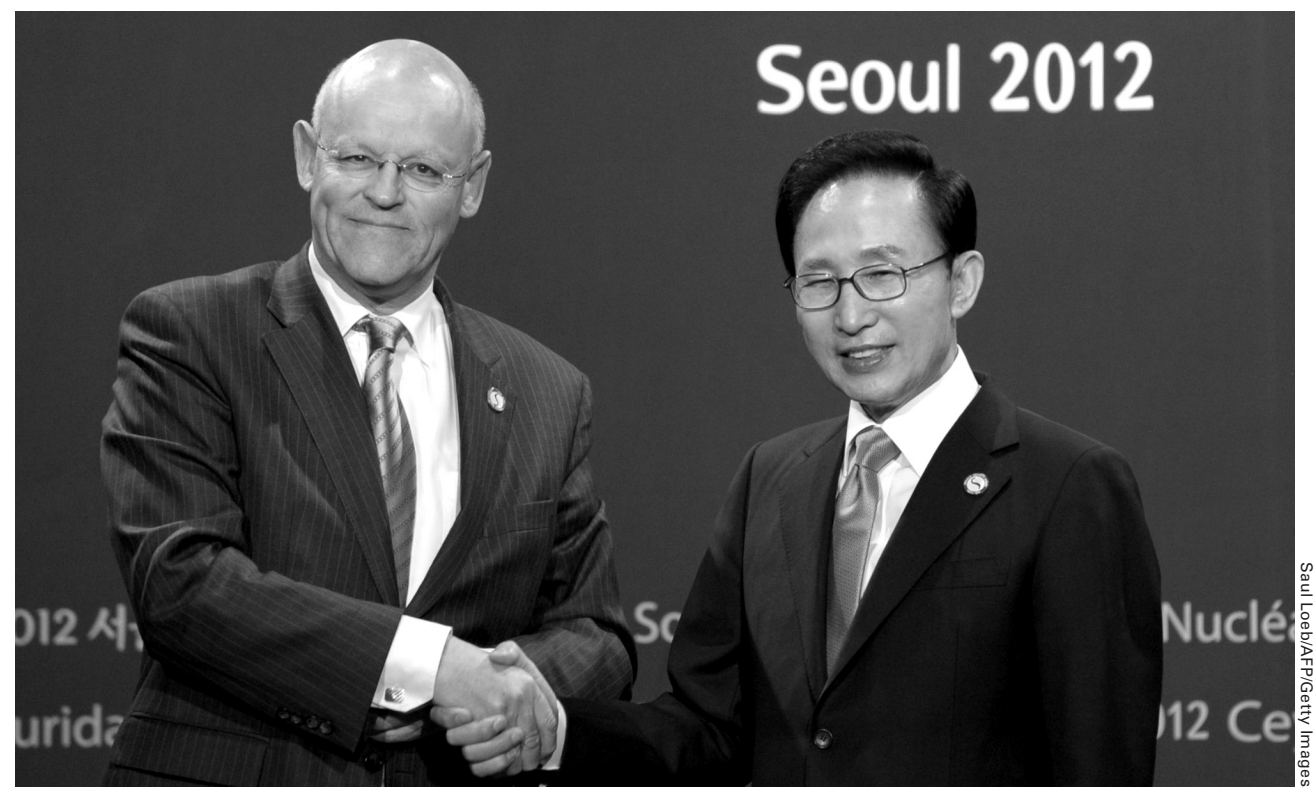
Lee Myung-Bak, right, president of the Republic of Korea, greets the Netherlands Foreign Minister Uri Rosenthal at the 2012 Seoul Nuclear Security Summit on March 26. The Netherlands will host the next Nuclear Security Summit in March 2014.

note that these efforts are limited by a distinct and pervasive lack of transparency and consistency in the current nuclear security regime. This needs to change, as numerous examples in other fields have demonstrated that overzealous confidentiality is itself a significant liability. The summit process has made progress in demonstrating that more information can be safely shared and that cautious openness can help lead to greater cooperation among states, but there is still much work to be done in this area.