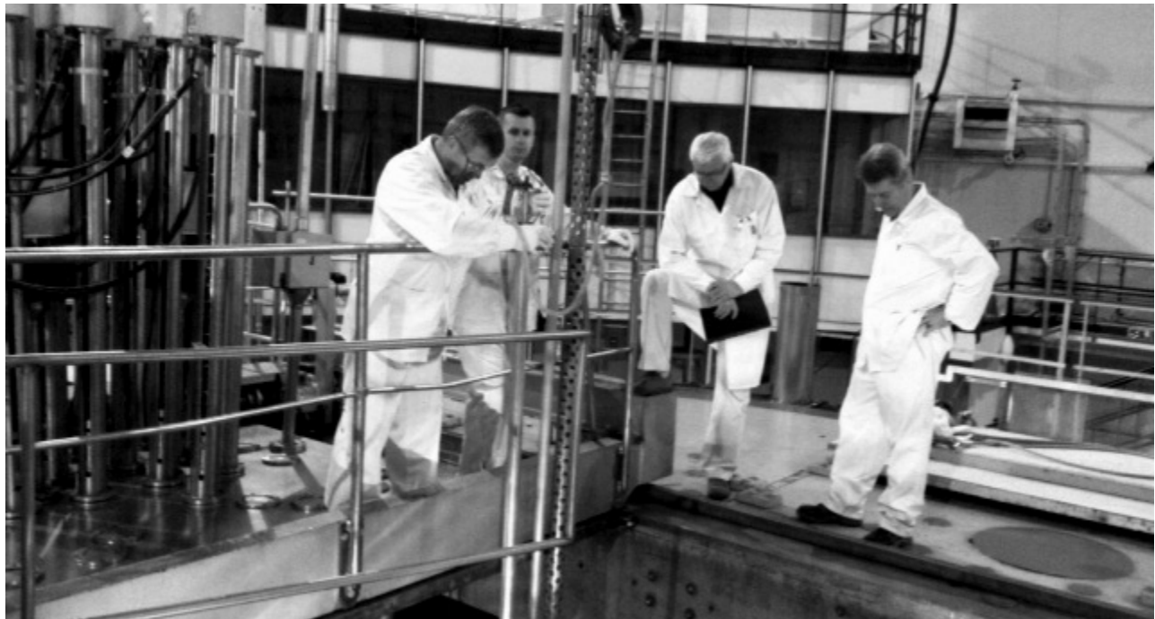
Poland's MARIA research reactor was converted to use LEU fuel in September 2012. Poland also committed to ship all of its spent HEU fuel out of the country by the end of 2016.

HEU fuel from Kazakhstan's Institute of Nuclear Physics has been sent back to Russia or downblended in Kazakhstan. By the end of 2016, HEU spent fuel from all converted research reactors in Poland will be returned to Russia. Hungary pledged to return its remaining HEU to Russia in 2013.