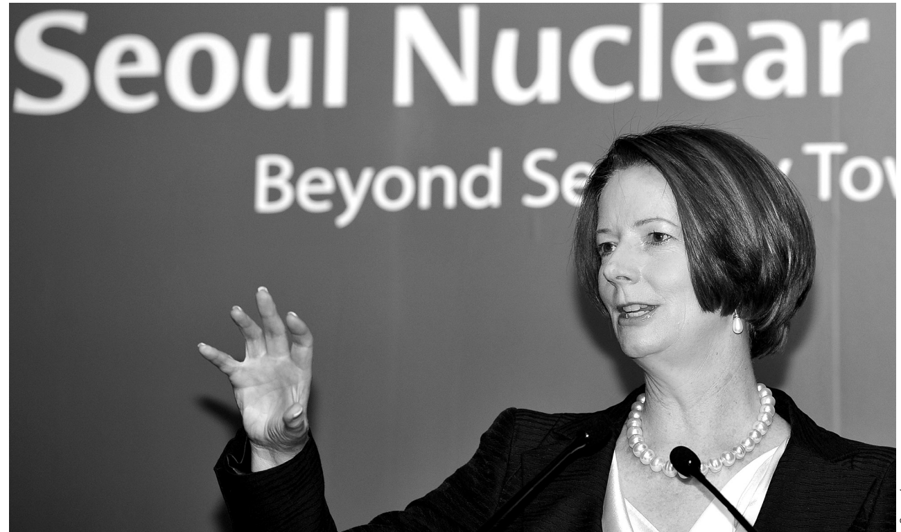
Australia's Prime Minister Julia Gillard speaks during a press conference at the end of the 2012 Seoul Nuclear Security Summit on March 27, 2012. Australia ratified ICSANT in March 2012.

Azerbaijan is strengthening its export controls to combat illicit trafficking. Brazil is revising its domestic laws and developing new rules on the physical protection of radioactive materials. Chile has drafted updated national regulatory instruments, including a proposal for establishing an independent regulatory authority, and it is concluding an administrative agreement to import and export radioactive material under the IAEA Code of Conduct. Indonesia is