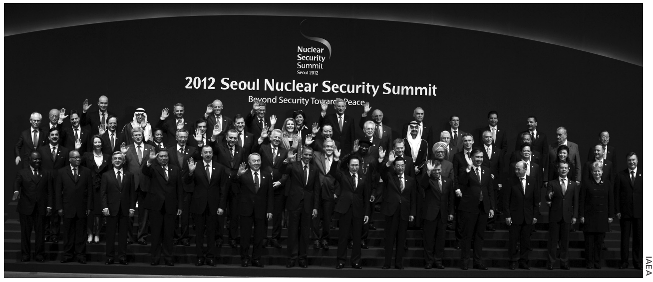
Leaders from 53 countries gathered in Seoul on March 26-27, 2012, for the second Nuclear Security Summit. Since the first summit was held in Washington, D.C, in April 2010, countries have made significant progress strengthening global nuclear security. A third summit will be held in the Netherlands in 2014.

norms. Also included in this section are efforts to update countries' Design Basis Threat models and improve law enforcement and emergency response strategies.