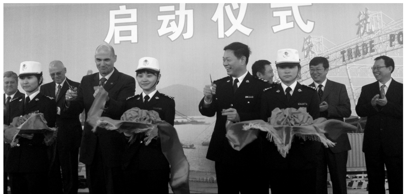
U.S. and Chinese officials cut a ribbon on December 7, 2011, to mark the commissioning of the Yangshan Megaports Initiative. In 2012, new Megaports became operational in Argentina and Vietnam.

states at 45 ports around the world. Since the Seoul summit, new Megaports have become operational in Argentina and Vietnam . In addition, Megaports in the following NSS countries have transitioned to local control (or will by the end of 2013): Israel, Malaysia, Mexico, Singapore, and Vietnam .