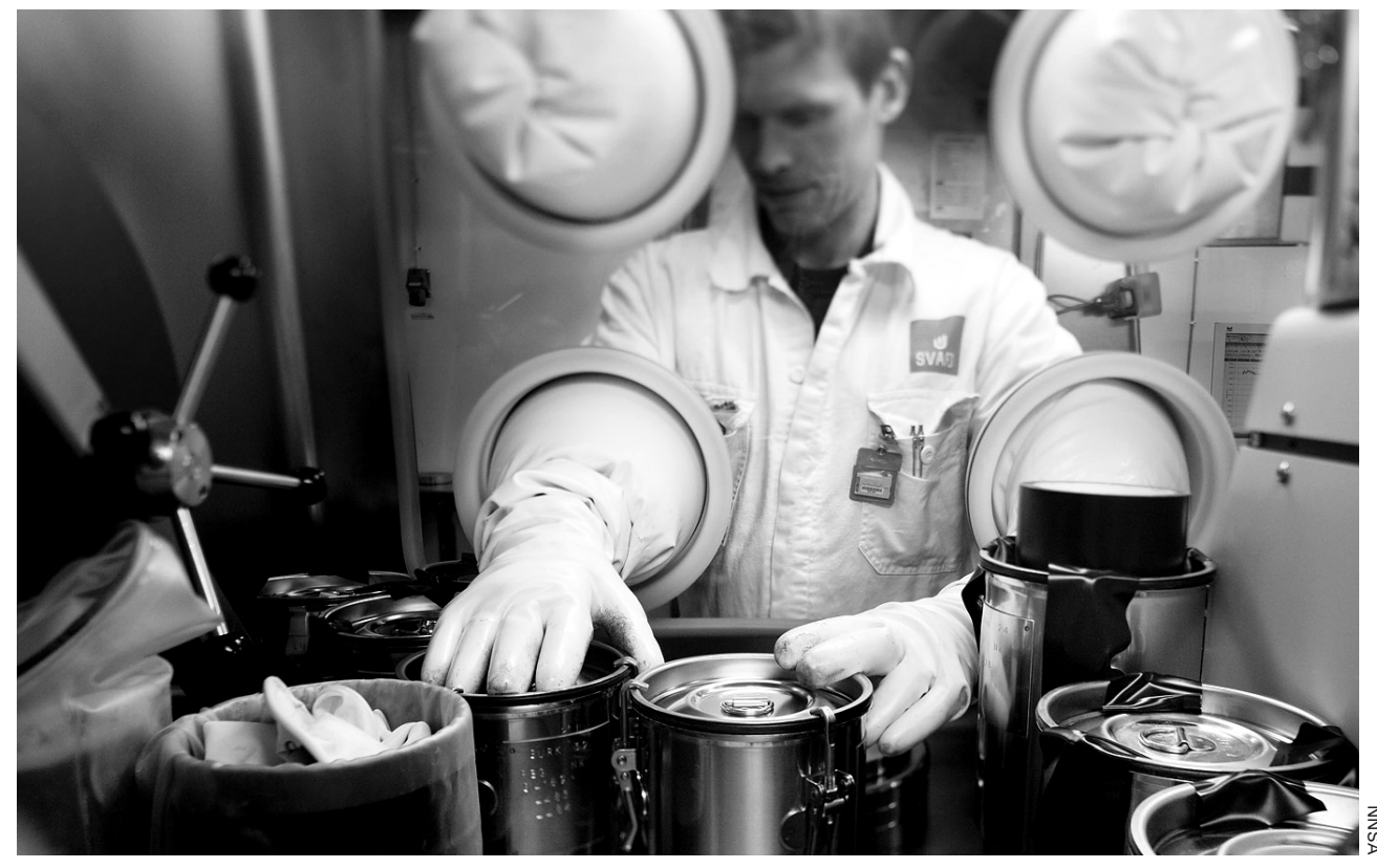
At the 2012 Nuclear Security Summit, Sweden announced that it shipped its remaining plutonium stockpile back to the United States. Belgium and Italy said they intend to return excess plutonium to the United States in 2014.

Australia, Hungary, and Vietnam are working to remove their surplus stocks of HEU by the end of 2013, and the removal of U.S.-origin HEU fuel from Japan's Material Testing Reactor is scheduled for later this year. Belgium and Italy intend to return excess U.S.-origin HEU and separated plutonium in 2014. Canada's repatriation of U.S.-origin nuclear materials is scheduled to occur between 2012 and 2018. In February 2013, Canada was awaiting final authorizations and preparations to begin transporting spent fuel rods from the Chalk River plant back to the United States.