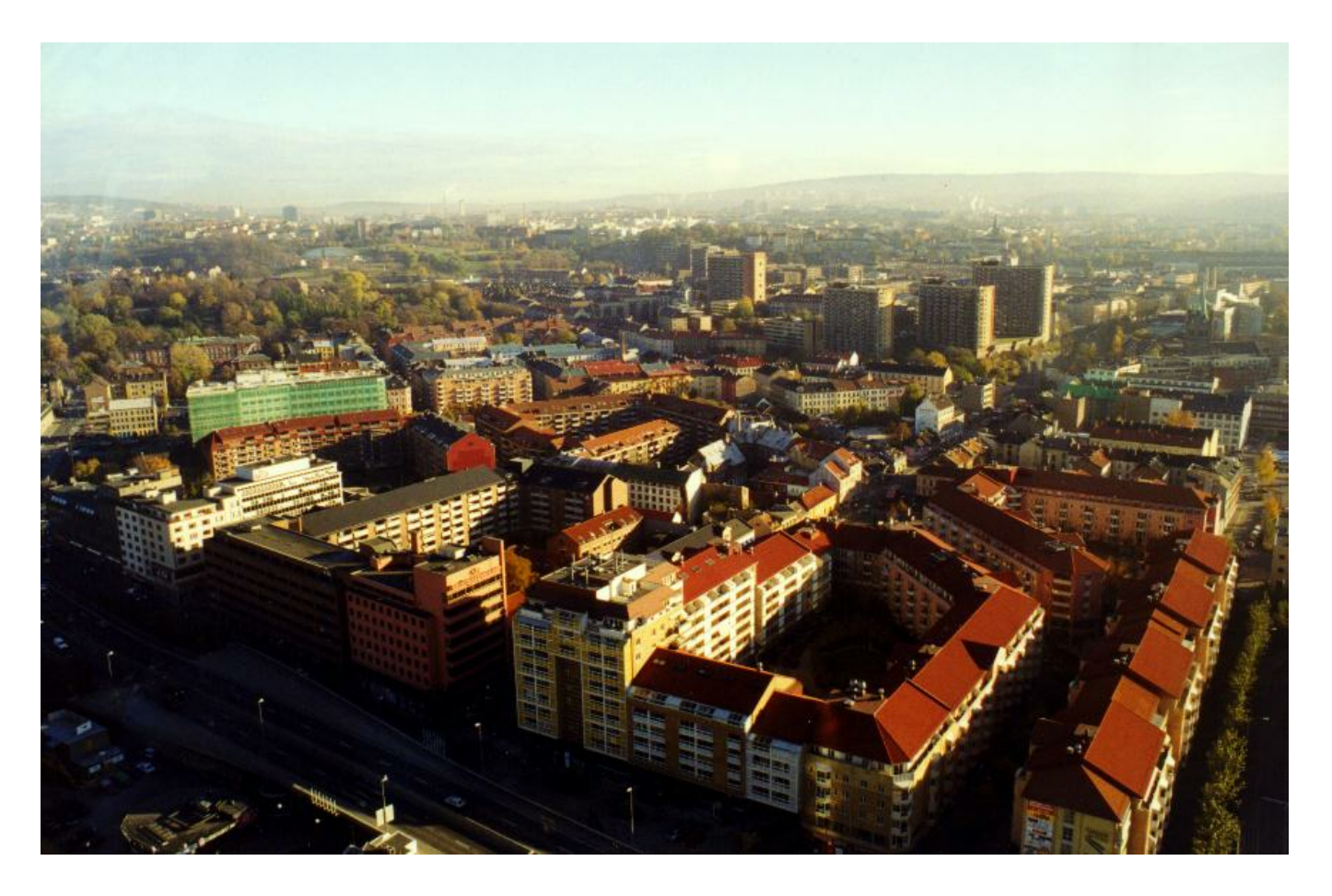
«Old Oslo» , a central part of the city, demonstrates a well planned and coherent structure of measures that provide good accessibility for all. The area has a developed town centre with all modern conveniences. There are people with different ethnical backgrounds, and there are some areas consisting of medieval buildings.

The way over all and long term planning creates a framework for the later stages of planning, must be identified. Usability by all seems to be regarded as a task for those who make the detailed solutions, and there is little consciousness as to how one, through over all and long term planning can lay down the conditions as to what degree usability by all may be achieved. A higher degree of consciousness about this will be of significance both to planning itself, as well as to those invited to participate and how this is carried out.