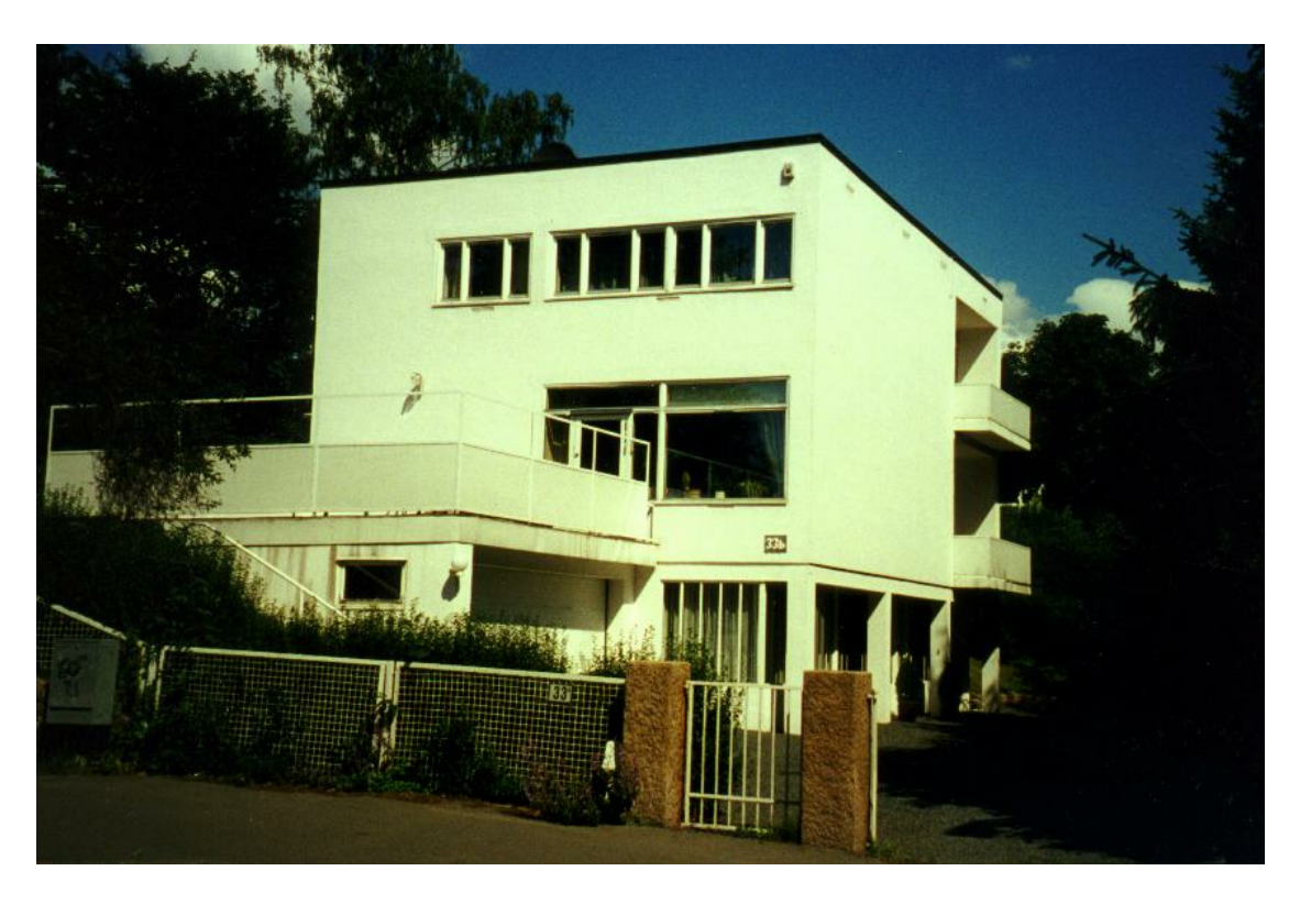
Functionalism The main notion of functionalism was that the form should reflect the practical functions. The architecture should develop according to the technical developments in other areas like aircrafts and cars, and should be rational, simple and inexpensive. A design for the general population was to be created, with the development of housing and plain interior decorations. Villa in Oslo, Architect Arne Korsmo 1937.

Functionalism maintained that the use and the materials should determine the design; however, no demands were made as to usability of all "products" by all people, including people with disabilities. The architects decided and defined the "use" and the "users" themselves.