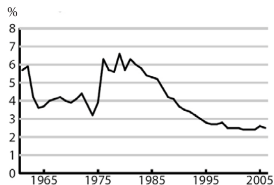
Figure 1: Military Spending by the Republic of Korea, 1961–2006, percentage of gross domestic product