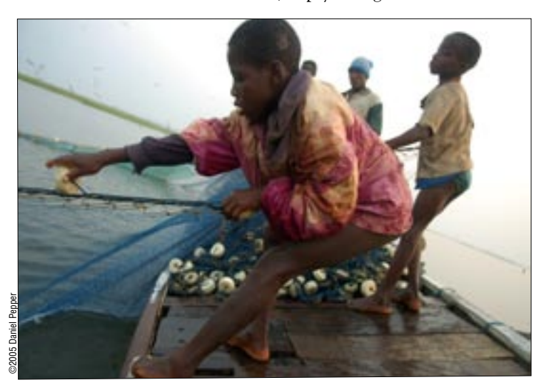
A trafficked Ghanaian child, one of thousands forced to work seven days a week, fishes in Lake Volta, Ghana. Rural children are either sold by their parents or exchanged for money, an agreement that is generally brokered by the fishing recruiters.

Trafficking in persons is modern-day slavery. Annually, approximately 600,000 to 800,000 people are trafficked across international borders; millions more are enslaved in their own countries. The common denominator of trafficking scenarios is the use of force, fraud or coercion to exploit a person for commercial sex or for the purpose of subjecting a victim to involuntary servitude, debt bondage, or forced labor. The use of force or coercion can be direct and violent, or psychological.