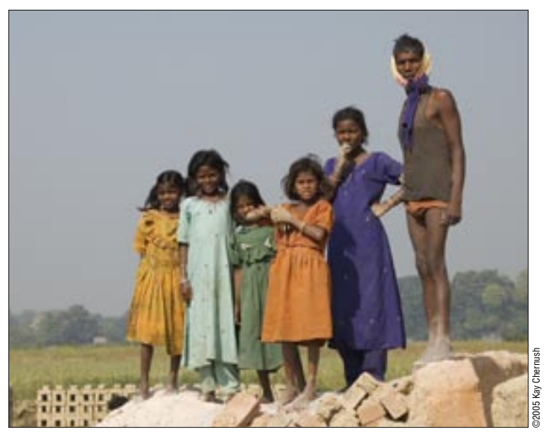
A family in rural South Asia, bonded into slavery for generations.