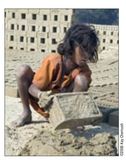
A small girl, bonded into slavery just as her parents and their parents before her, labors under the hot sun forming bricks from clay in rural South Asia.

Most instances of forced labor occur as unscrupulous employers take advantage of gaps in law enforcement to exploit vulnerable workers. These workers are made more vulnerable to forced labor practices because of unemployment, poverty, crime, discrimination, corruption, political conflict, and cultural acceptance of the practice. Immigrants are particularly