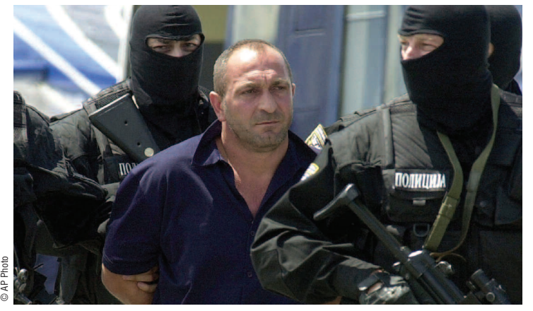
Convicted Macedonian trafficker

Trafficking impacts many nations, including the United States. That's why the U.S. Government has taken a number