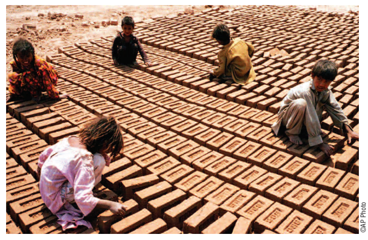
Abused children in South Asia

of serious and significant actions to combat trafficking occurring at home. A few examples of American efforts include: