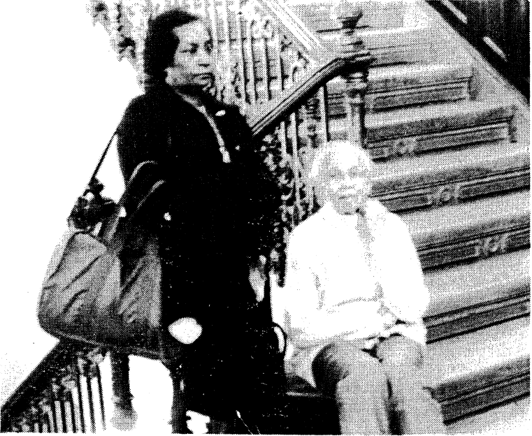
... homecare worker with client.

contract under an 11th-hour strike notice in June 1985—over a year-and-a-half of negotiating. We won a slight improvement in wages and benefits as well as establishment of a grievance procedure and a modified union shop.