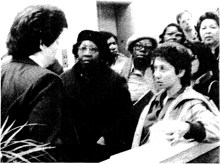
...SEIU 880 members confront the boss.

gaining recognition (although this does happen in a small number of cases), but to get the OC members and other members to "come out of the closet" in front of the boss. The Recognition Action gives workers their first real sense of the power of group action and is usually a tremendous "high" for all those involved. It also gives the workers a chance to intimidate the boss for a change, and it puts management on notice that the workers are well organized and that if they try to mess with people, the OC will take swift and appropriate action.