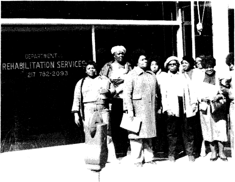
... Chicago Homecare Workers protest at Illinois Department of Rehabilitation Services.

industries and regions of the country where traditional unions would not, could not or did not organize—most notably, home health care workers in Boston and Chicago; fastfood workers in Detroit; hotel workers in New Orleans, and workers in small, low-wage sweat shops in Philadelphia.