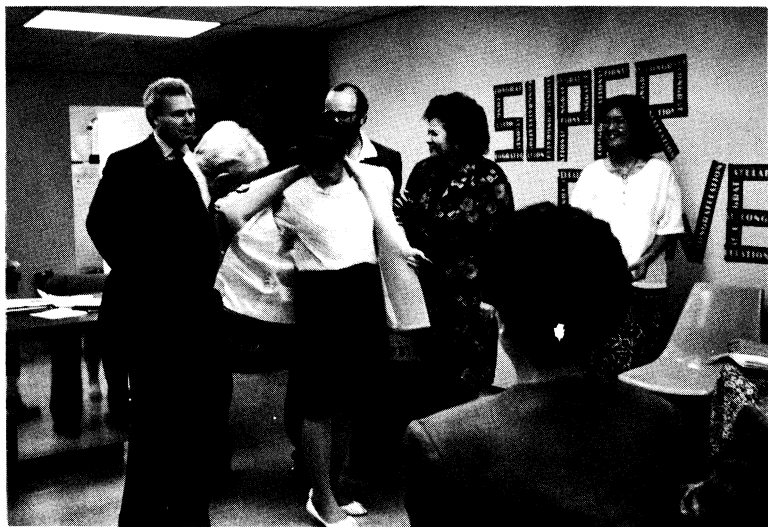
Graduate of "Super Sewer" class wearing coat she made.

management committee for the women's and children's apparel industry was formed in 1989, by the union and several industry associations. Known as the Council for American Fashion (CAF), this group has formed a series of area committees as the organizational vehicles for addressing local apparel industry development problems.