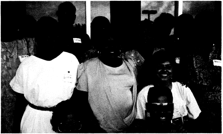
Fairwood Wells workers, originally from Haiti.