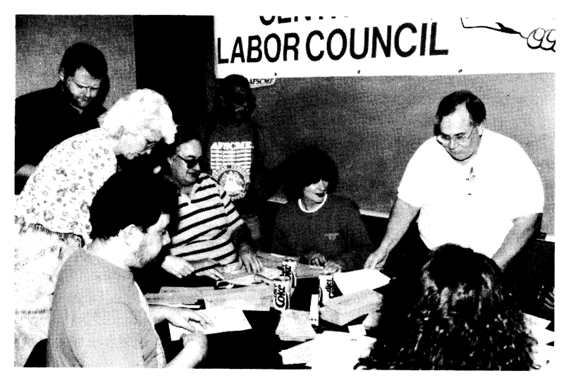
PAC in action—sending our newsletter to members.