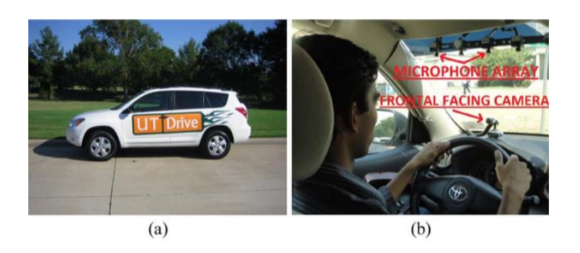
Table 2.2: (a) UTDrive car and (b) sensors placement

The video recording methods were found as the most commonly used to identify the movement that affect a distraction while driving. Li & Busso (2015) in their investigation towards the distraction while driving using the video recording. The study relies on real world driving data by using the UTDrive platform which is a vehicle equipped with multiple sensors including a microphone array, a frontal camera, and a road camera as shown in Figure 2.2 below. The car also records various controller area network bus (CAN-bus) signals that described the vehicle activity.