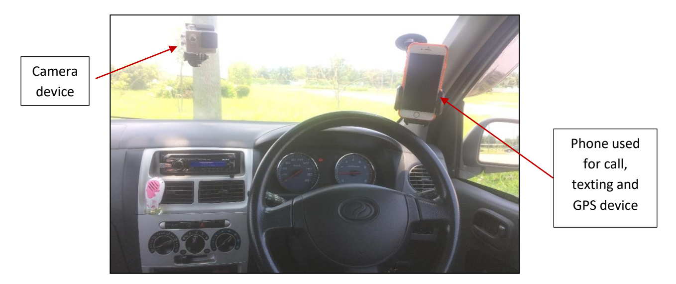
Figure 3.3: The experimental devices that have been installed in the car.

GoPro camera used as the recording equipment in this study. This camera used to record all of the respondent's activities and movements while driving a car during the secondary task given. It should be installed properly to avoid other technical error and should be checked before start the tasks given. The camera was placed at the center of the front side mirror in a car so that can captured all the eye and body movements of the driver. The placing of the camera is shown in Figure 3.3 below. All the recorded videos were used for the data analysis. The phone used in this experiment was provided, but the respondents can use their own phone if they comfortable with it. The placement of phone was chosen by the respondents either want to hold with the phone holder or want to hold by using their hand. It is considered to make the respondents comfortable and act as normal with their common behavior while driving.