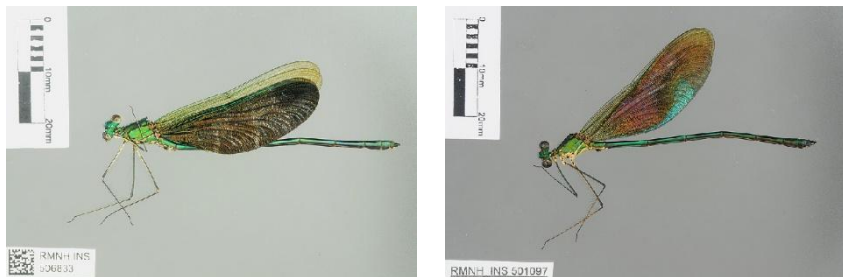
Figure 2. Morphology of Neurobasis chinensis (common green metalwing) (left) and Neurobasis longipes (long-legged metalwing) (right)

Meanwhile, D3 was identified as Neurobasis longipes based on its morphology. However, the COI barcode for D3 (MT266925.1) had the closest match to Neurobasis sp. (MF804737.1) originated from Myanmar and Neurobasis chinensis (MG518624.1) originated from unknown provenance with 100% identity thus suggesting that the Neurobasis sp. (MF804737.1) may be Neurobasis chinensis . The damselfly under the genus of Neurobasis are commonly known as metalwing. As both Neurobasis longipes and Neurobasis chinensis share a common distribution area (Peninsular Malaysia) and have similar morphology, misidentification might occur as it is a very difficult and challenging to build identification keys to separate all Neurobasis species [4]. A morphological comparison of Neurobasis chinensis and Neurobasis longipes is shown in Figure 2. To date, there are no COI barcodes for Malaysian Neurobasis chinensis available in the GenBank.