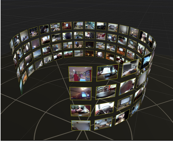
Figure 3: Cylindrical results view as shown from a third-person perspective.

of result display is reminiscent of result displays in conventional interfaces [29] and does not make full use of virtual space by itself, this single-layered approach avoids result images occluding each other while allowing a large number of results to be browsed simply by looking around the virtual space.