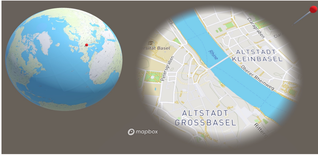
Figure 2: An example of the interactive map for spatial query formulation centered on Basel, Switzerland. The globe mini-map on the left shows the location of the detail-map on the right.

previous result sets in case the refined query does not yield more promising results.