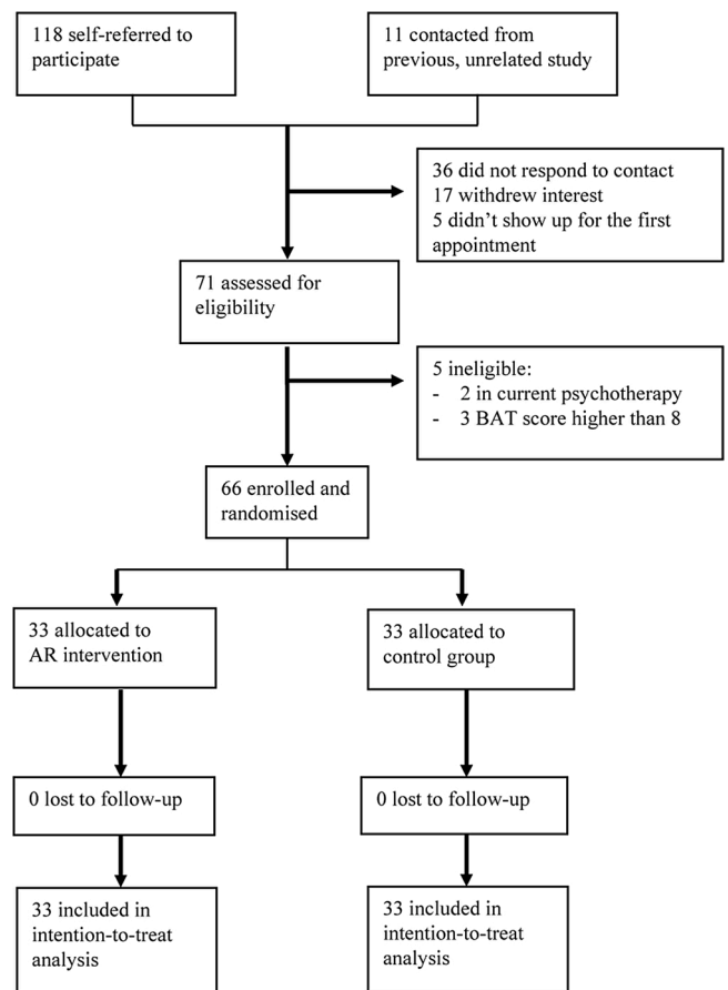
Fig. 2. Trial profile. BAT = Behavioural Approach Test.

Since all randomized participants completed the trial and no protocol violations were observed, the per protocol analysis was identical to