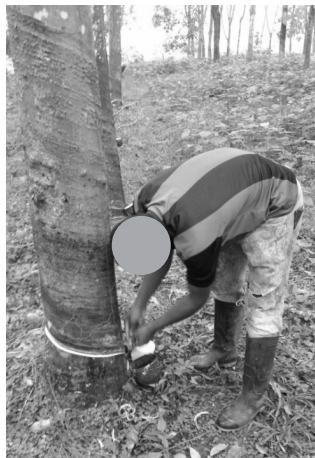
Activity 1: Tapping. In this image the cut is performed near the ground

located on each tree and gather the latex in drums to facilitate their transport to the latex treatment area where next activity is carried out, as shown in Figure 1.