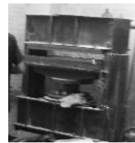
d) Types of molding presses used for compression molding