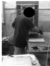
c) Molds handling for compression molding