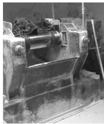
a) Mixing in the open rolls mill