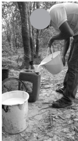
Activity 2: Latex collection in drums