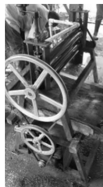
Activity 4: Rolling