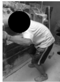
Activity 4: Mill cleaning