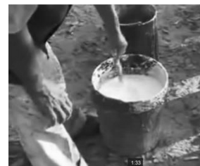
Activity 3: Filtering and dilution of latex