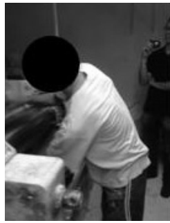
Activity 1: Incorporation of ingredients to the mill