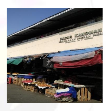
Figure 3 Kanoman Market which is part of Kanoman Palace area