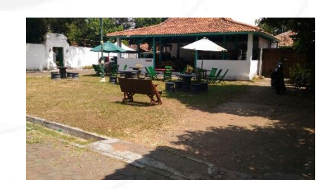
Figure 4 Cafe located in Kacirebonan Palace

In addition to sharing space performed by the palaces in Cirebon is collaboration. According to Indonesian dictionary collaboration is a partnership or partnership. Inductively the palaces in Cirebon show the collaboration with the entry