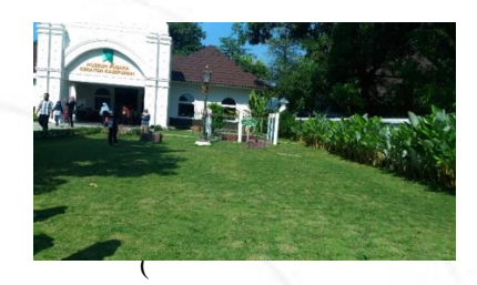
Figure 2 Photo of Heritage Building at Kasepuhan Palace

Kanoman palace area. Kacirebonan palaces do sharing in the form of opening a cafe to the public in the palace Kacirebonan yard. The following are pictures of space sharing by palace palace in Cirebon.