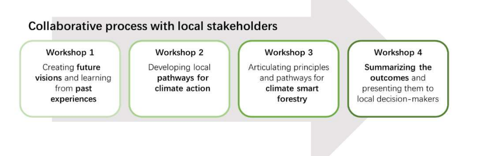
Figure 1. The set-up of the transdisciplinary collaborative process in the "Bring down the sky to earth" project, of which this study reports output from Workshop 3.