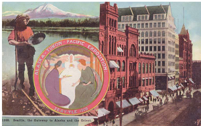
Figure 2: Advertisement for Alaska Yukon Pacific Exposition, 1909. Photograph courtesy of University of Washington Libraries Special Collections, Seattle, Washington [UW22327, PH Coll 777].

While Seattle promoted itself as the key city in the West, other well-established ports controlled western trade. The purpose of advertisements, like the widely distributed postcard titled “Seattle, the Gateway to Alaska and the Orient,” was to demonstrate Seattle’s ties to Alaska and Asia. This became the official emblem of the AYPE. (See figure 2.)