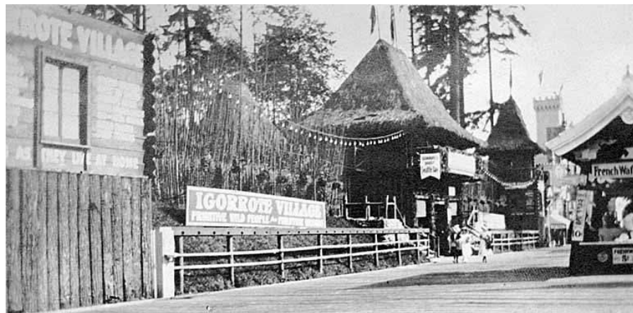
Figure 3: "Igorrote Village Entrance, Alaska-Yukon-Pacific Exposition, Seattle, Washington, 1909."

“Oriental Village” and “Eskimo Village.” In each, Fair officials demonstrated how primitive the cultures were compared to the cultural and technological advancements of Seattle the United States. This served a dual purpose. It reinforced the supremacy of American culture and juxtaposed primitive cultures with the industrialized modern age. Historian Manish Chalana explained, “ethnographic villages provided a contrast to the exhibits showcasing industrial advancements elsewhere in the Fair, projecting ideas of progress, civilization, savagery, and empire.” 17 Ethnographic villages provided sharp contrast to exhibits that promoted technological advancements such as the Incubator Baby exhibit.