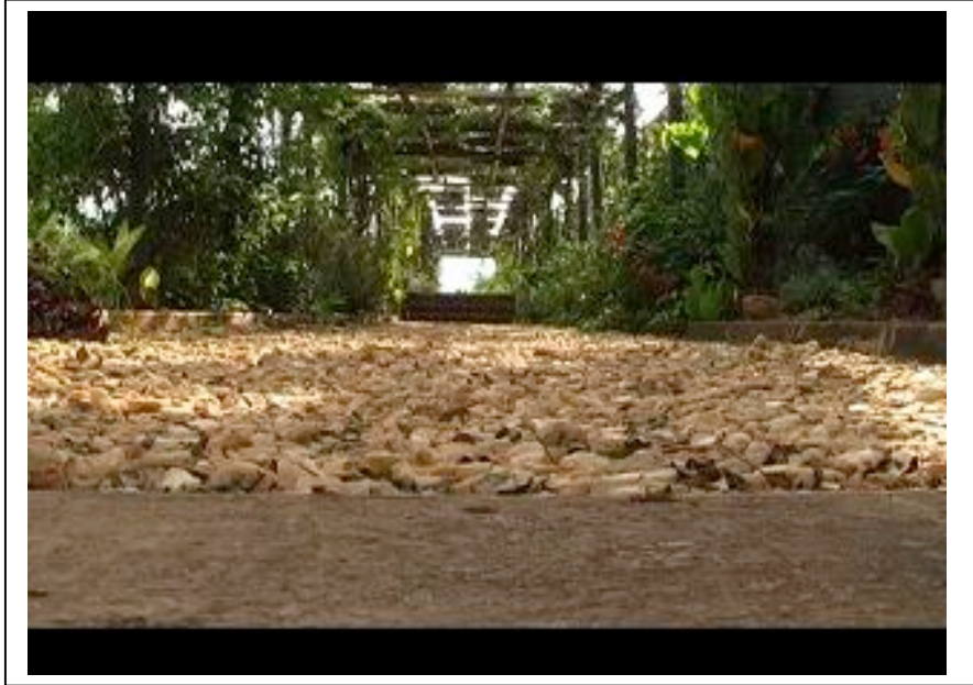
Exhale 6: KMC ground.

CLICK HERE TO LAUNCH VIDEO FILE ( MP4 – size 7.5 MB)