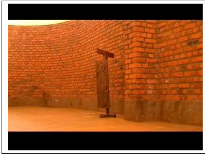
Exhale Clip 1 - Blood Wall., Rwanda.

CLICK HERE TO LAUNCH VIDEO FILE ( MP4 – size 15.5 MB)