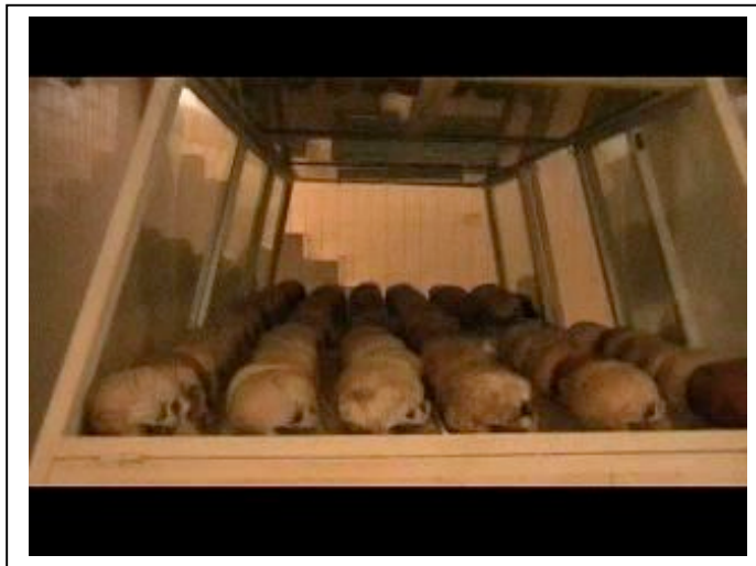
Exhale Clip 2: A Crypt Entry

Another dissolve to black with a superimposed title in white: “A crypt below the church”. Fading-in mid-movement on my hand-held descent into the as yet unseen crypt, laborious steps clomp and echo, while the camera’s focus is on the altar opposite. I enter Hades. At 07:13 I slow my gate and exhale loudly — it is this same breath that accompanies the opening title. Nothing has prepared me for this. The audible deflation of my lungs is testament to literally having the wind taken from me. I pause, momentarily, each movement more considered now as I approach the adjacent set of white tiled steps, bathed in the diminishing light from upstairs. To my right panes of glass can be seen but it is only as I place the mini-tripod on the crypt’s steps and turn the lens around that my unduly laboured breath acquires meaning for the viewer. For an instant, before another fade to black, rows of human skulls in an open glass display are evident: “Nameless victims...”