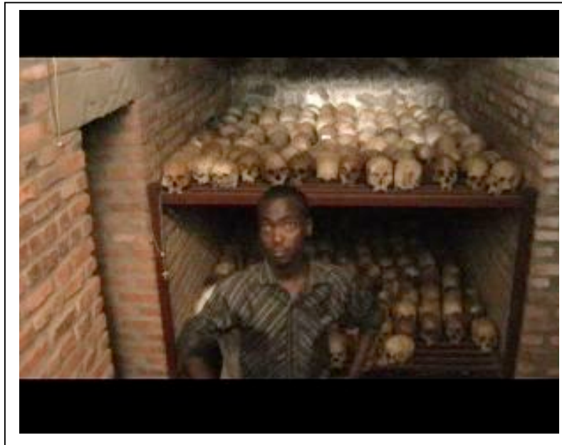
Exhale Clip 5: Outside crypt. CLICK HERE TO LAUNCH VIDEO FILE ( MP4 – size 21 MB)

He is visibly both perplexed and incredulous at what he encounters. Hands on hips he recounts that more bodies are being exhumed each day (the sacks seen in Exhale's opening seconds). He stops and stares into the camera and beyond, grimacing, seemingly incapable of cognitively processing what he has just related, and sighs despondently. Felly and Theo leave the tomb. But the static set-up is drenched in the ambient noise of the surrounding neighbourhood and the visible dance of shadows and light across the inanimate skulls. As the camera's unflinching gaze objectively records the static evidence of atrocity, the disembodied, joyful sounds of children at play in the late afternoon twilight incongruously reverberates across the high gain wash of the DV image.