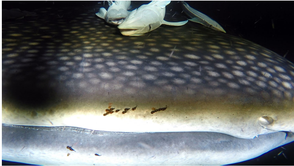
Fig. 1. Anterior view of a whale shark ( Rhincodon typus ) mouth, including whale shark copepods ( Pandarus rhincodonicus ) attached to the top and bottom lips and the sharksuckers ( Echeneis naucrates ) feeding on euphausiids.

Both whale shark copepods and echeneids have developed uniquely different morphologies and mechanisms to cope with the substantial drag forces associated with living in a symbiosis with the world's largest fish (see Norman et al. 2000; Britz and Johnson 2012). The attachment of both copepods and echeneids has previously been shown to be a hydrodynamic burden to their host, creating a parasitic relationship, where the host no longer benefits from the relationship and indeed is negatively impacted (e.g. Helfman et al. 2009). Some hosts actively try to dislodge echeneids and copepods (e.g. Ritter 2002; Brunnschweiler 2006; Misganaw and Getu 2016), although we are not aware of reports of whale sharks actively trying to dislodge these organisms. Understandably, the impact of ectoparasites is likely to be far more pronounced in smaller fishes; the large size of the whale shark may render such relationships innocuous. These relationships may therefore be more accurately described as commensal (or perhaps even mutualistic), and in the case of the whale shark copepod's relationship with the whale shark, perhaps a combination of parasitism (as inferred by the presence of whale shark DNA in the copepods), commensalism and mutualism (the copepod hitches a ride and removes microbiota from the host).