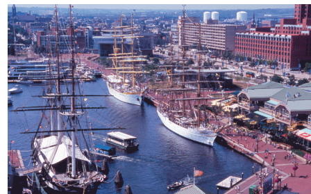
Baltimore's scenic harbor.