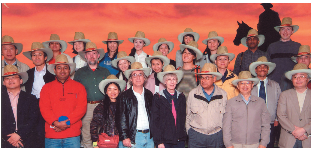
Participants gather for a round-up at the 2008 Asia-Pacific Regional Annual Meeting (held in Brisbane in July) at the Australian Outback Spectacular Dinner Show in Australia's Gold Coast.