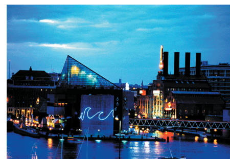
Baltimore's harbor at sunset.