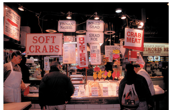
Baltimore loves its crabs—whether steamed or in tasty crab cakes.