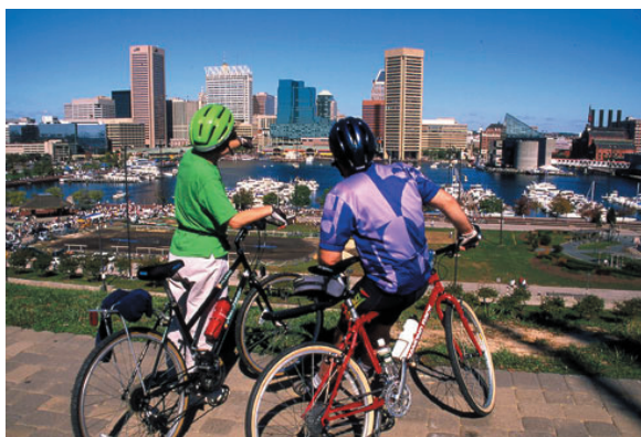
Bicyclists admire the view of the harbor from the nearby Federal Hill neighborhood.