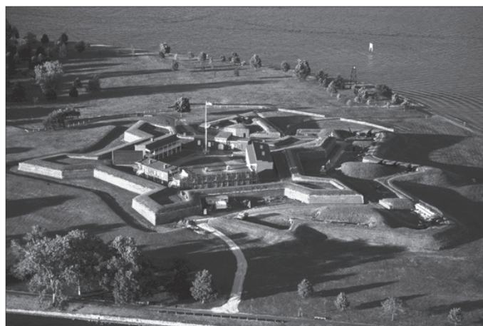
The star-shaped Fort McHenry is a famous point of interest in Baltimore. It was the valiant defense of the fort during the War of 1812 that inspired Francis Scott Key, a lawyer and amateur poet, to compose the Star Spangled Banner.