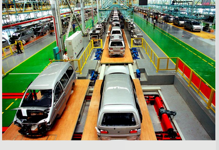
SGM of Wuling Co., Ltd