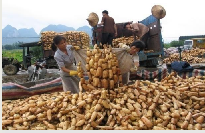
Baipeng Town: Lotus Roots