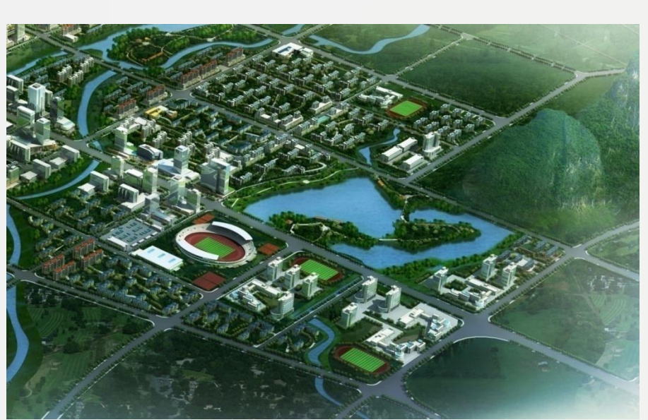
New Central Area