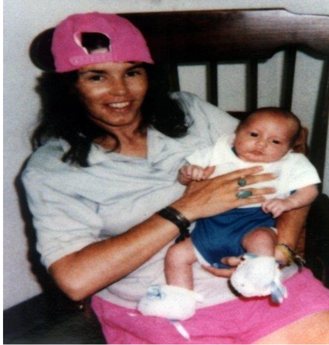
Figure 1. My biological mother and I.