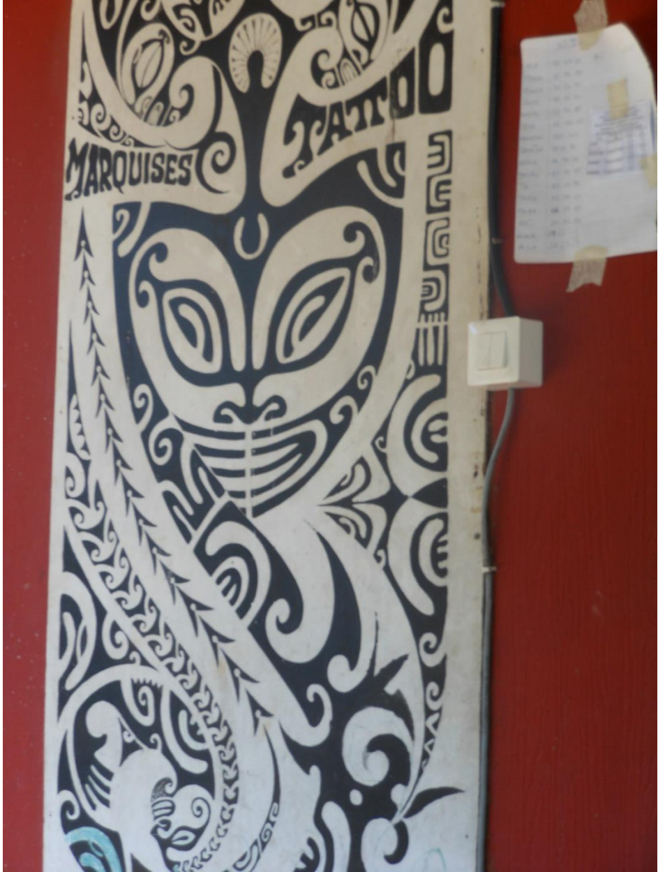
Figure 8. The Hakatoa household mural.