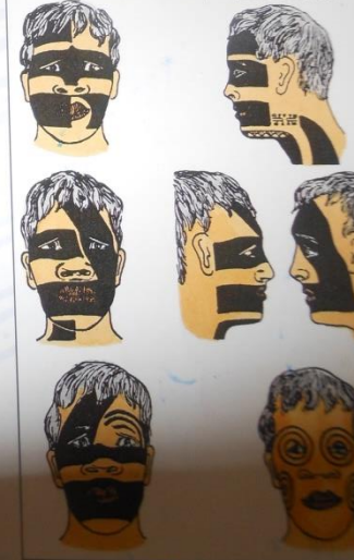
Figure 7. Historical Marquesan tattoo images

Une grande quantité de tatouages faciaux ont été répertoriés. En voici quelques exemples.