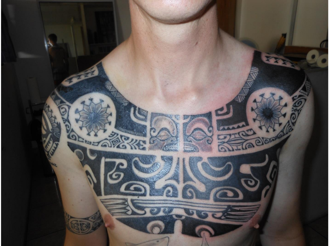
Figure 6. Completed chest tattoo.