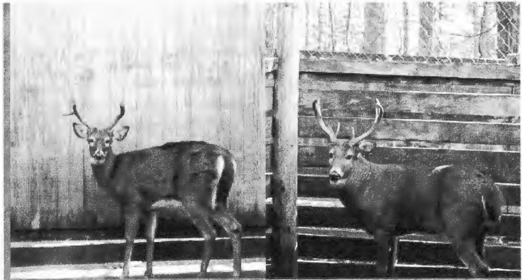
Figure 2. A comparison of body mass of males in the breeding season a GnRH vaccine treated male (left) and a control male of similar age.