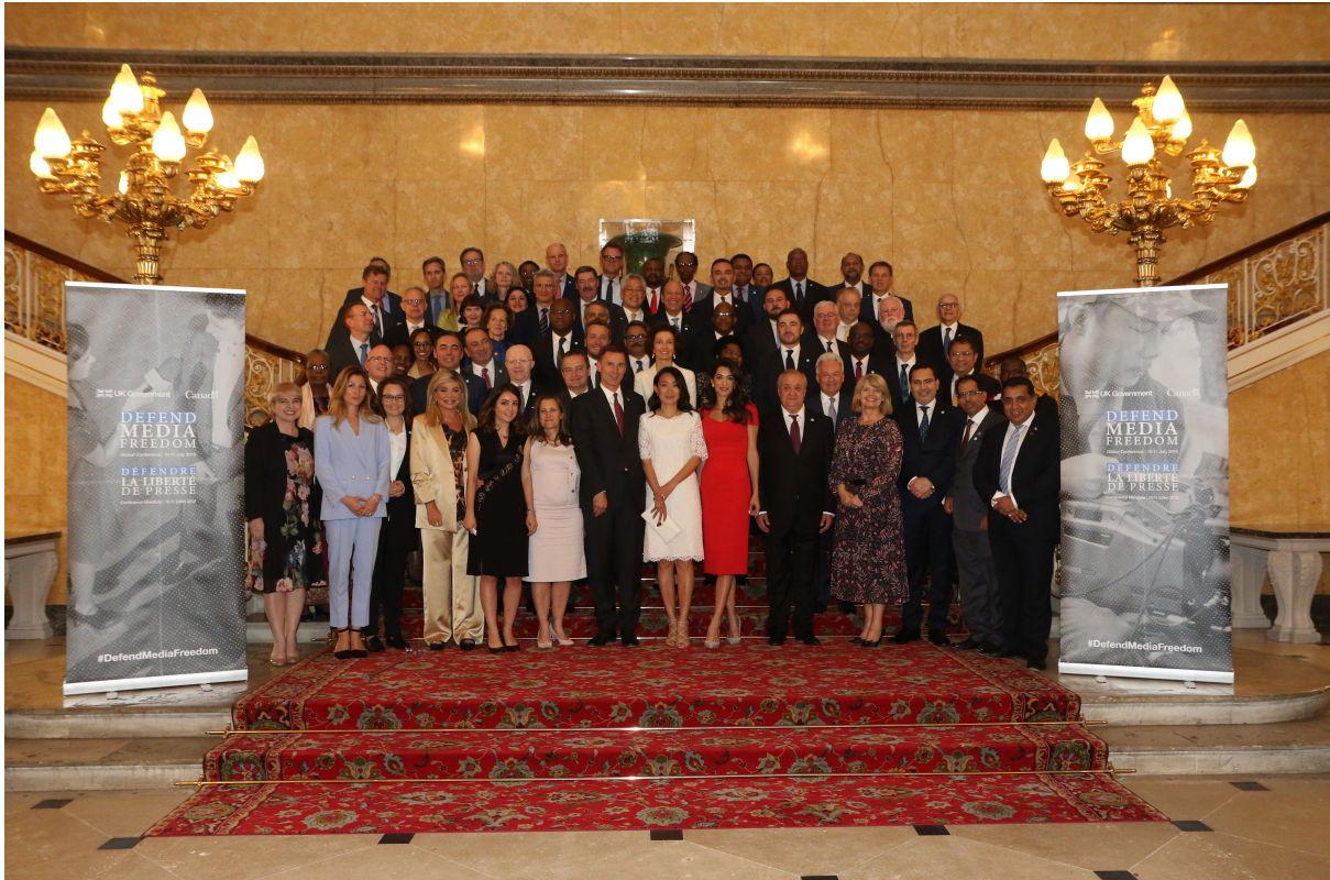
Lancaster House at the first Global Media Freedom Conference in London, July 2019