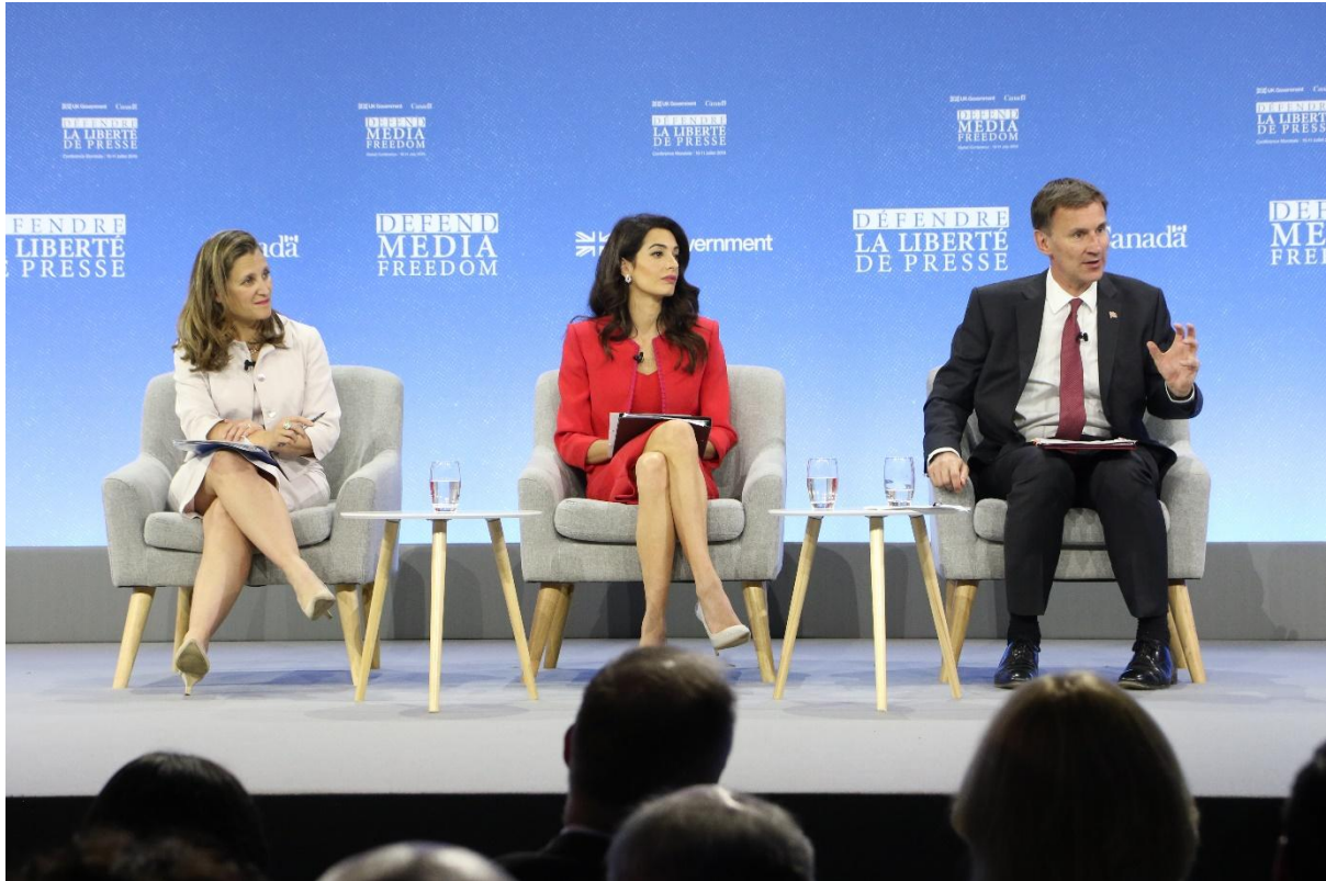
Chrystia Freeland, Amal Clooney and Jeremy Hunt at the launch of the MFC at the first Global Media Freedom Conference in London, July 2019