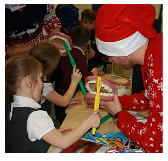
Student Engagement. Students worked with children on community intervention project activities.

I have learnt to work more efficiently and effectively in a group scenario by learning my colleague's strengths and learning from them and allowing them to pursue tasks they are better suited for to achieve our mutual aim. This is great for the future, since as a clinician I am required to work with colleagues in patient's best interest.