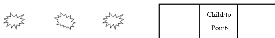
Figure 1. Example of 'Odd One Out' Card and Response Card.

This training task (adapted from Odd One Out Span [54]) focused on the child's visuospatial EWM and was based on the Odd One Out task. A different set of odd-one-out stimuli to the outcome assessment materials was used to eliminate practice effects and overlap. The task was presented with paper-based materials, rather than on a tablet computer, but otherwise had the same format as the Odd One Out task. Odd-one-out stimuli were each presented as black-and-white line drawings on 10 cm × 30 cm white cards. The response card depicted one or more blank horizontal grids, each containing three empty boxes. The child was asked to remember the spatial location of the 'odd one out' items by pointing to the correct position/s on the grid (see Figure 1 for examples).