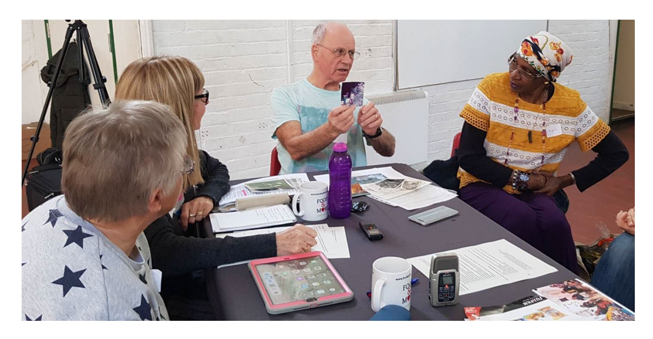
Figure 1. Participants share memories triggered by personal photos. Case study 1.

The participants co-curated a public exhibition of their material which was held at the exhibition space of a local university, providing a wider audience for their images. Participants selected the material to be included (images, captions and recordings of descriptions of the photos) and were invited to attend the opening of the exhibition as 'experts' with their families and friends. Several participants asked the researchers if the series of workshops could be replicated, expressing positive feelings towards the time they spent together and confirming the strong bonds with others created through the project.