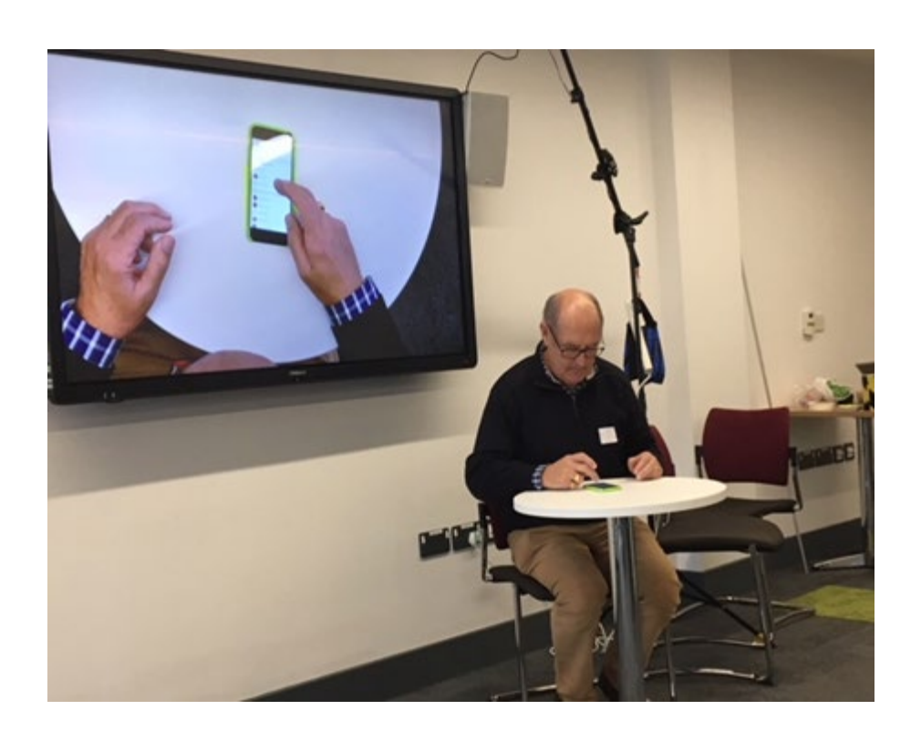
Figure 2. Live streaming of a participant demonstrating mobile photo-sharing activity. Case study 2.

Following some initial reluctance, several volunteered once they had seen the innovative data capture system working. The audience participants became coproducers and even directors as they gave verbal directions, suggestions and prompts to those volunteer participants whose photo-sharing activities were being recorded. This level of interaction and use of participant generated images and captured behaviour gave control and autonomy to participants (Dodman, 2003) which enabled 'photovoice' for older people, who as a group who might otherwise remain voiceless in research (Wang and Burris, 1997). The workshops themselves became an act of sharing knowledge and experience not just for the benefit of the research but for the practical benefit of the participants. Peer to peer tutoring occurred, sharing advice on short cuts, photo editing, and 'how to' guidance across android, and Apple phones and tablets. Participants shared their skills but were also transparent in expressing their worries about; sharing photos digitally, privacy, their perceived lack of knowledge regarding open or closed groups on social media platforms and any lack of confidence they felt in interacting through digital technologies. The technology capacity of