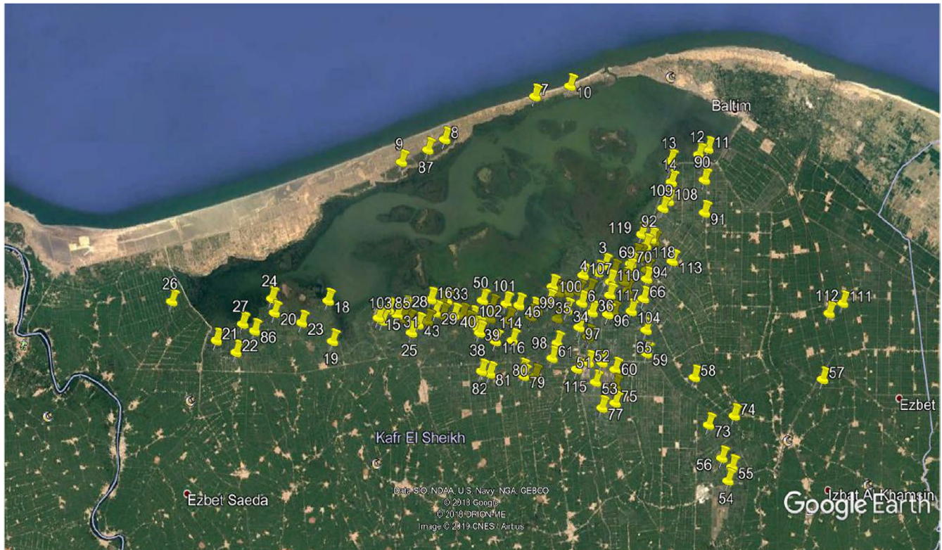
FIGURE 1 Locations of the Nile tilapia ( Oreochromis niloticus ) farms surveyed in Kafr El-Sheikh governorate, Egypt

University, Egypt (approval number: IAACUC-KSU-21-2018) and the University of Stirling's General University Ethics Panel (GUEP546).