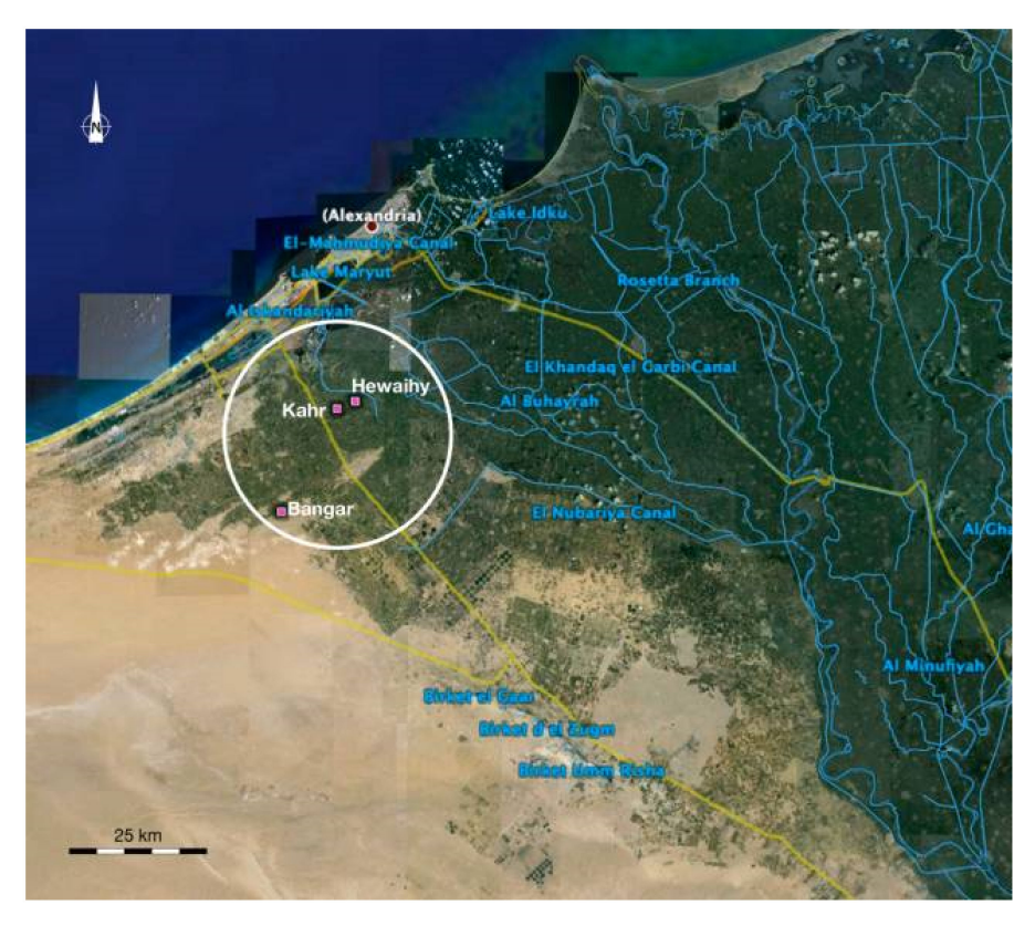
Figure 1. A map of the three investigated study areas south-west Nile Delta, Egypt.

The study was conducted in a region located in the southwest Nile Delta, Egypt (lat of 30.93^{\circ} N and long of 29.89^{\circ} E). Field work campaigns were conducted in wheat fields during the March of the winter season 2007 concurrent with satellite imagery acquisition. The field campaigns were planned to couple with the capturing time of satellite images. March time was chosen for detecting stress in wheat crops since the climate starts to be warmer over this period of time and wheat crops grow quickly. To have a spatial variation in crop health status, three study areas were selected, namely, elnaser, elkahr and elbangar covering a large area. The predominant soil of these study areas is mainly a sandy loam, since these lands have been reclaimed and cultivated recently. The climate in this region can be described as having slightly hot summers and moderate winters, with average minimum and maximum temperatures of 16.6~^{\circ} C and 24.3~^{\circ} C, a rainfall of 0 mm and 28.3~^{\circ} mm per year; humidity of 69 and 68%; and wind speed of 3.7~^{\circ} and 3.94~^{\circ} To have varying growing conditions of wheat such as healthy, water and salinity induced stress, twelve fields were selected across the entire study site (Figure 1).