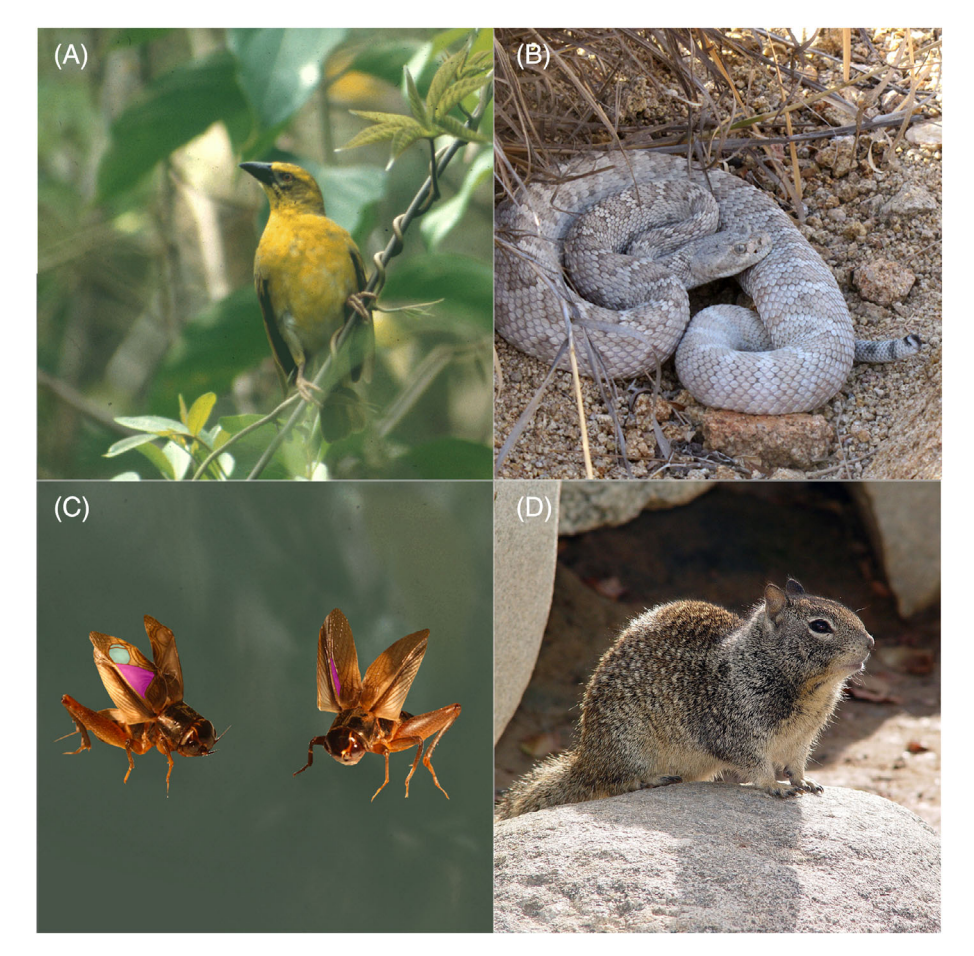
Fig. 2. Species reported to exhibit behaviours which, due to changes in ecology or morphology, are rendered non-adaptive. (A) Village weavers Ploceus cucullatus retain foreign egg-rejection behaviours hundreds of years after colonising islands on which brood parasitism was (until recently) absent. However, their ability to discern foreign eggs has been undermined by morphological changes in egg appearance under this relaxed selection (Lahti, 2006). (B) The rattlesnake Crotalus catalinensis has through morphological change lost the ability to produce the characteristic 'rattling' signal, likely due to the absence of larger predators. Nevertheless, this species still exhibits 'rattling' behaviour by shaking its tail when threatened (Shaw, 1964). (C) In Hawaiian populations of oceanic field crickets Teleogryllus oceanicus , males continue to express energetically costly wing movements associated with the production of song, despite the loss or reduction of morphological structures on their wings which renders them silent (compare highlighted wing features in the normal-wing male, left, with those of the silent 'flatwing' male, right) (Schneider et al. , 2018). (D) Ground squirrels Otospermophilus beecheyi retain the ability to recognise and express anti-predator behaviours targeted to predatory snakes present in their ancestral range up to 300,000 years after colonising habitats in which the snakes are absent, whereas resistance to snake venom was attenuated more rapidly (Coss, 1999). In these four examples, non-behavioural (morphological or physiological) traits were lost or reduced, whereas associated non-adaptive behavioural traits remained.

The persistence of non-adaptive anti-predator behaviours can also interfere with other fitness-associated traits, in which case they should be under reversed selection. Schooling behaviour, for example, while an effective anti-predator defence, interferes with intra-specific interactions by reducing the ability of individuals to defend resource patches (Huntingford, 1982; Seghers & Magurran, 1991), and is predicted to be under reversed selection in low-predation environments (Seghers & Magurran, 1994). Yet, in Trinidadian guppies ( Poecilia reticulata ), initial laboratory-based behavioural assays