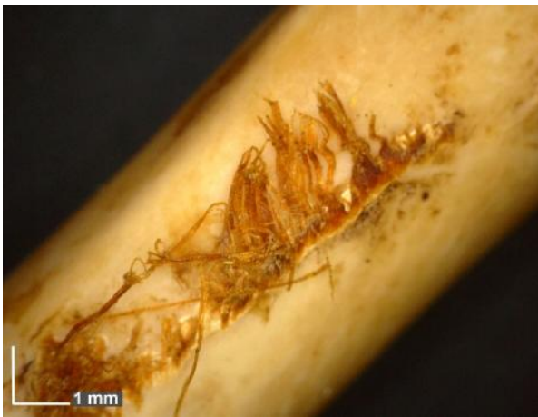
Fig. 2. Detail view of soft tissue remains on great auk ( Pinguinus impennis ) femur recovered at the Covesea Caves, north-east Scotland (unstratified context, Covesea Cave 2).