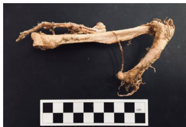
Fig. 1. An articulated great auk ( Pinguinus impennis ) leg fragment recovered at the Covesea Caves, north-east Scotland. Left to right: tarsometatarsus, fibula, tibiotarsus, and femur (Trench 4, Context 406, Covesea Cave 2).

Remains of the great auk have been identified in three of the four caves investigated. However, only one individual specimen was found at both Covesea Cave 1 and the Sculptor's Cave, with the overwhelming majority deriving from Covesea Cave 2. Preservation of the remains overall was consistently excellent, with little to no weathering or fragmentation. One recovered specimen represented the remains of an articulated "leg", including tibiotarsus, femur, fibula, and tarsometatarsus (Fig. 1). In addition, some bones still had the remains of soft tissue adhering to them (Fig. 2). Unfortunately, most of the great auk fragments derived from unstratified or mixed deposits (Table 1) but in Covesea Cave 2 five fragments were attributed to stratified contexts of Neolithic/Bronze Age (N = 2) or Medieval/Post-Medieval date (N = 3).