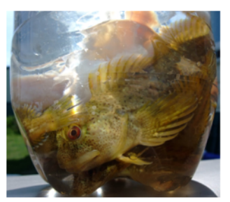
Figure 1 . A graphic of a bottle trap (top) and photograph of captured, large shannies (bottom). Based on observations, the graphic shows how larger fish tended to enter the trap and take bait first, whilst smallest fish were last. Once inside the trap, fish had difficulty relocating the entrance and no escapes were observed.