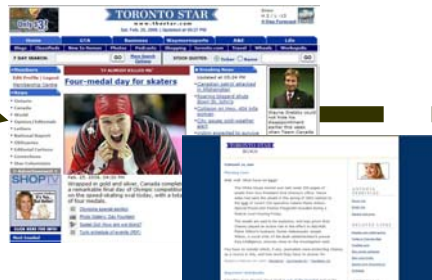
February 2006 (with added blogs, podcasts and other new features)