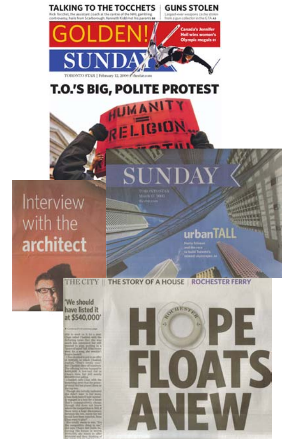
The redesigned Sunday 'magapaper'