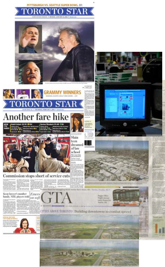
New approaches to page design

The most overt and experimental attempt at magazine techniques was a newly redesigned Sunday Toronto Star . The Sunday edition had traditionally remained the ‘forgotten’ weekend edition in relation to the voluminous flagship edition on Saturday. Yet as a weekend paper it had a lengthy lead-time (a week or more), and a generous availability of page space (due to less advertising take-up). Sunday was an ideal edition to re-launch as a new experimental ‘magapaper’ in early 2005. Full-page photos, liberal use of art and graphics, and longer, more contextual feature stories. While the Sunday edition continued to be something of an exception, it simultaneously introduced one way to a possible future for the Toronto Star .