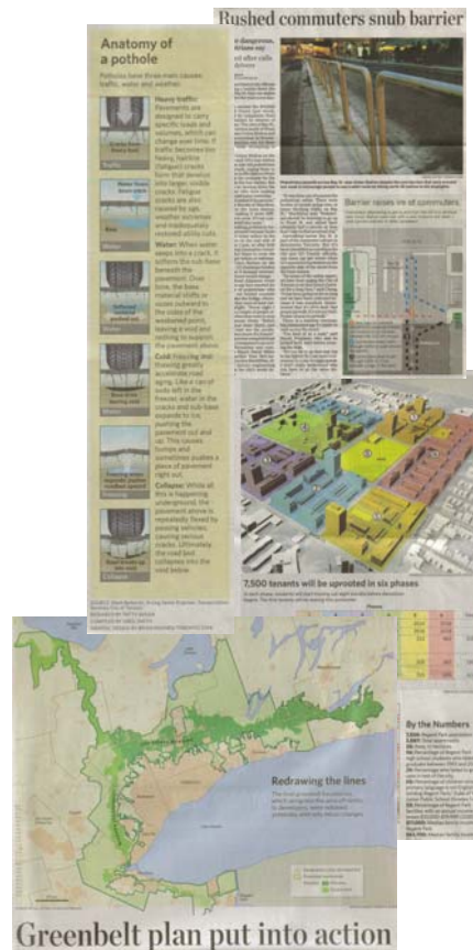
Examples of 'Infographics'