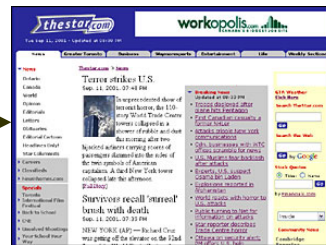
11 September 2001