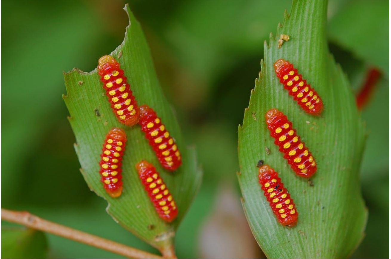
Figure 1b: Caterpillars on cycad ( Zamia )