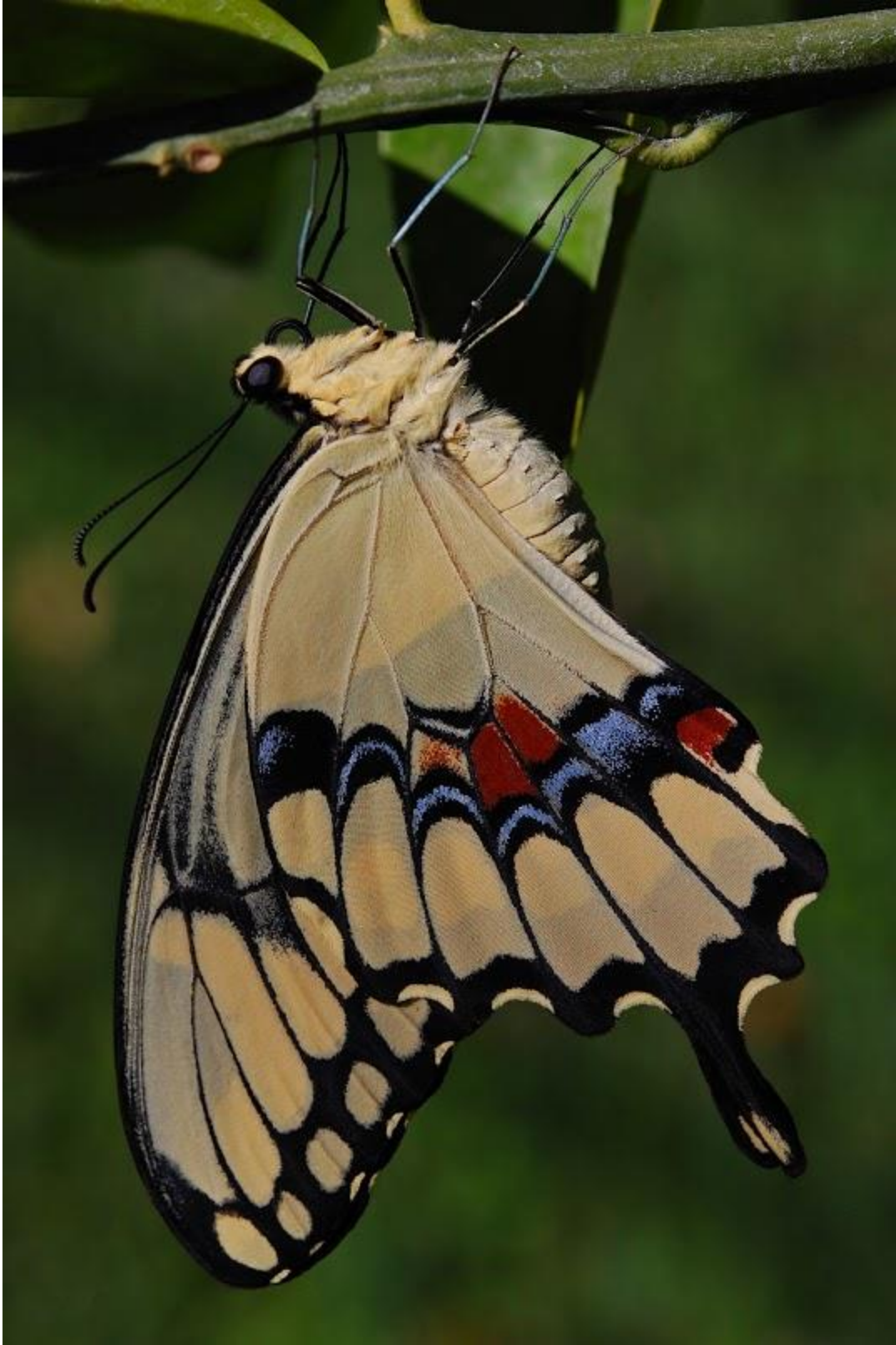
Figure 2c: Adult (side view)