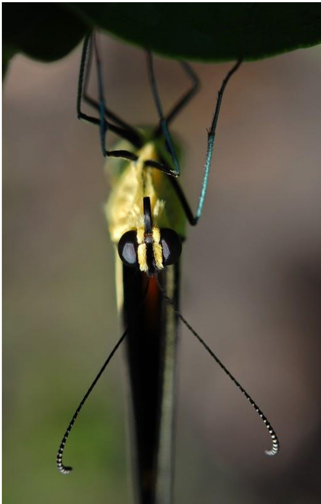
Figure 2d: Adult (front view)