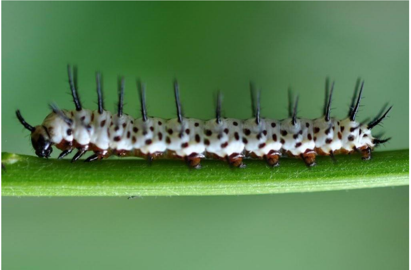
Figure 3a: Caterpillar

Zebra Longwing ( Heliconius charithonia )