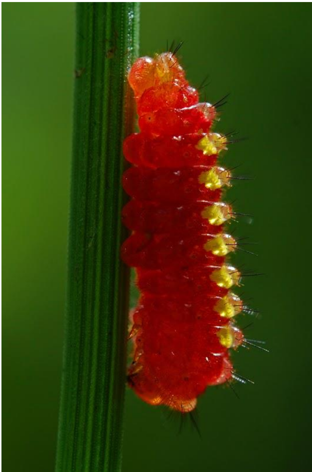
Figure 1c: Caterpillar on horsetail ( Equisetum )