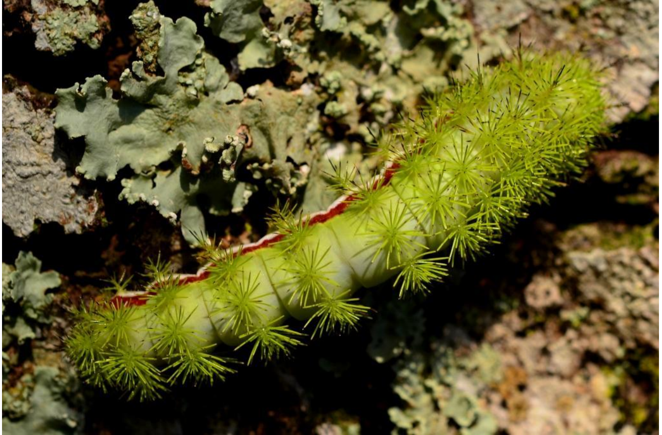
Figure 5: Caterpillar