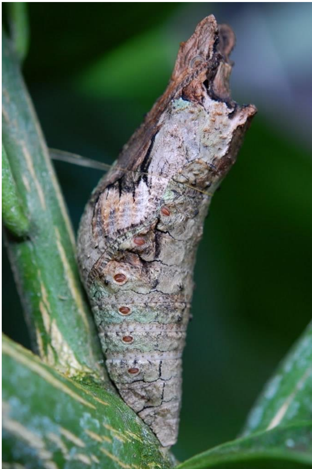
Figure 2b: Pupa