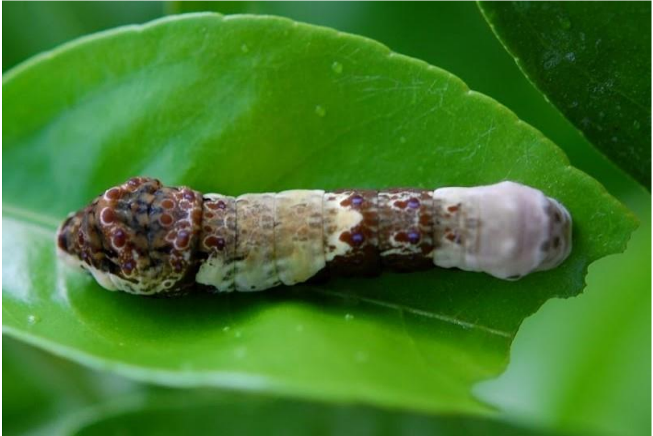
Figure 2a: Caterpillar