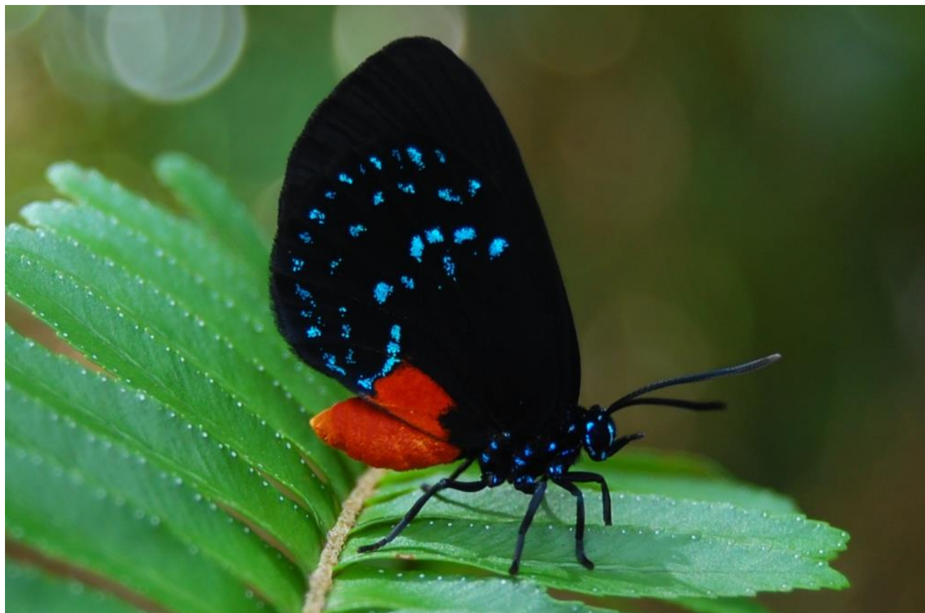
Figure 1e: Adult on fern