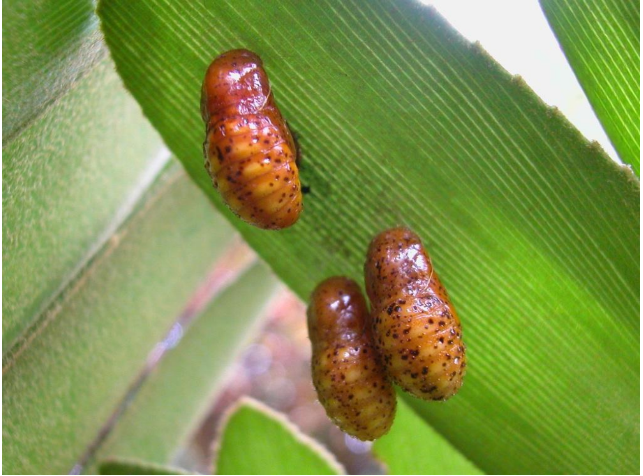
Figure 1d: Pupae on cycad ( Zamia )