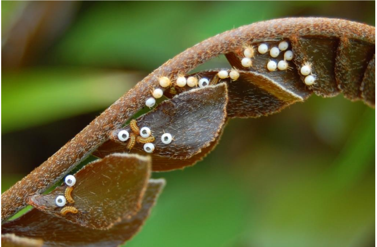
Figure 1a: Eggs and newly hatched caterpillars on cycad ( Zamia )