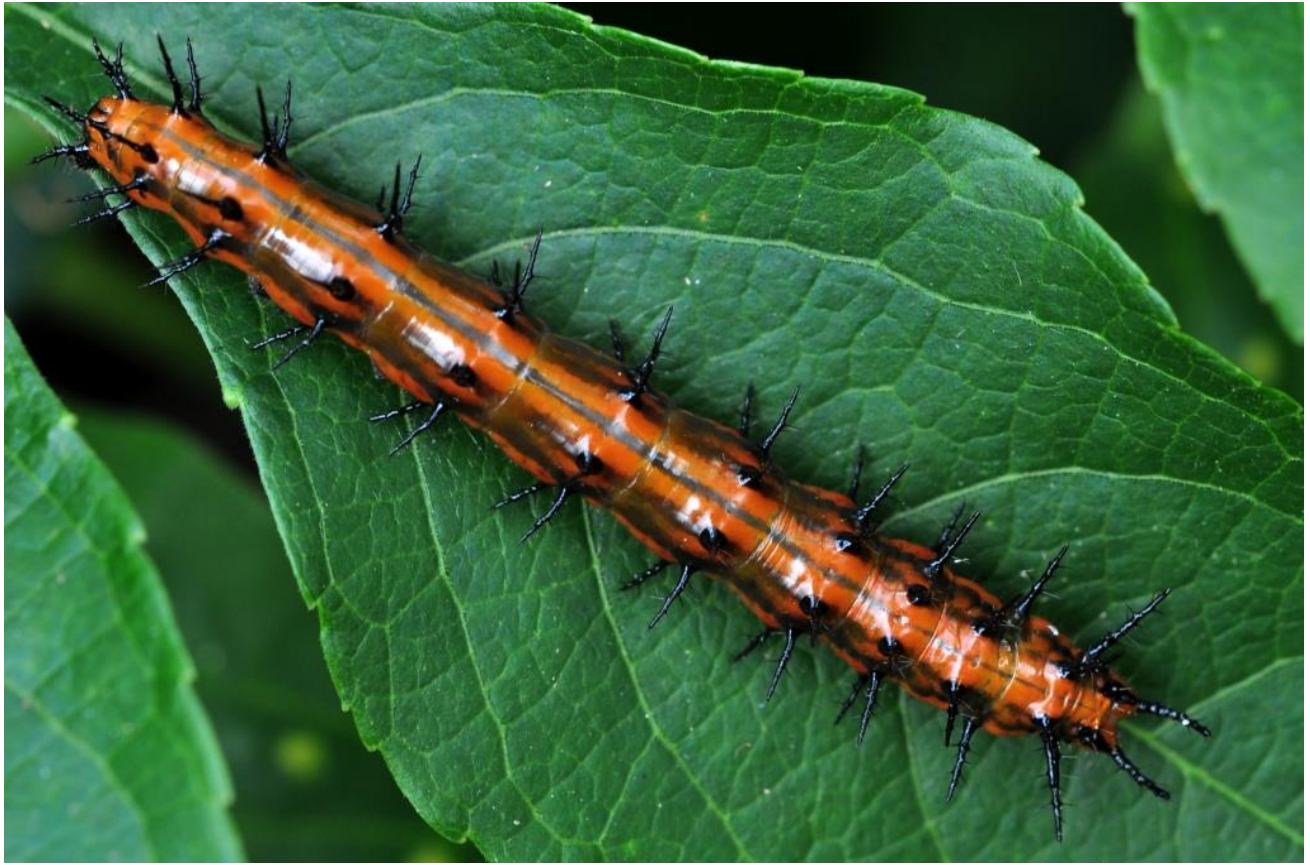
Figure 4a: Caterpillar on passion flower ( Passiflora )