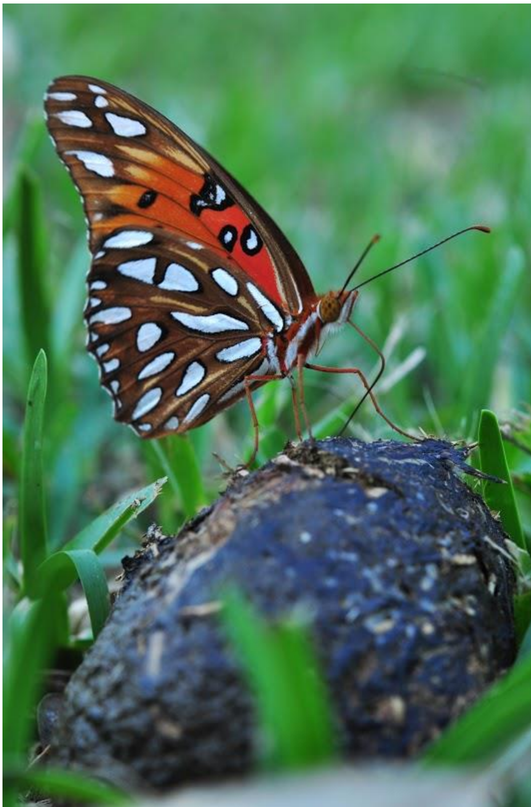
Figure 4b: Adult on manure