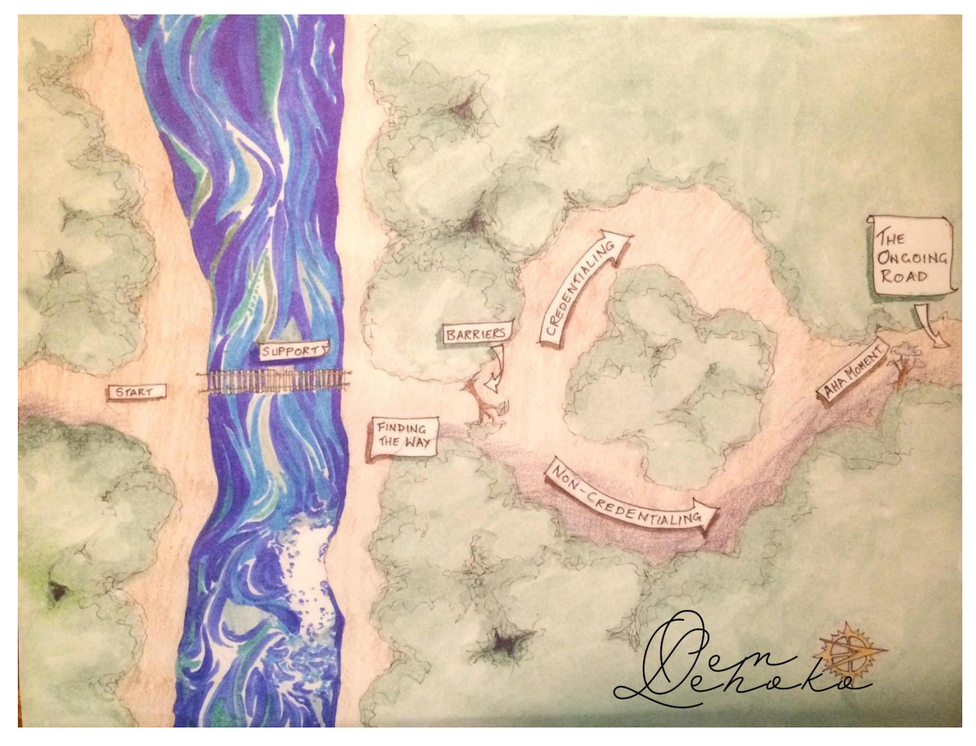
Figure 1. The Journey to Clinical Instructor Competence

representation of support with the bridge only represents one location of support that in actuality occurred throughout the participants' journey to competence. The fork in the road of credentialing actually occurred for some participants at the very start rather than further into the journey. Finally, the "ah-ha" moment may have occurred in different locations in the journey.