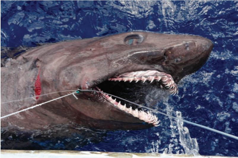
Figure 1. Lateral view of a bigeye sand tiger Odontaspis noronhai captured and released in western North Atlantic in March 2008, showing hooking location and gross anatomy of head. White strip along bottom margin of photo is side of capturing vessel.

with the ventral edges terminating just below the insertion of the pectoral fin. The first dorsal fin origin was distal to the posterior insertion of the pectoral fin.