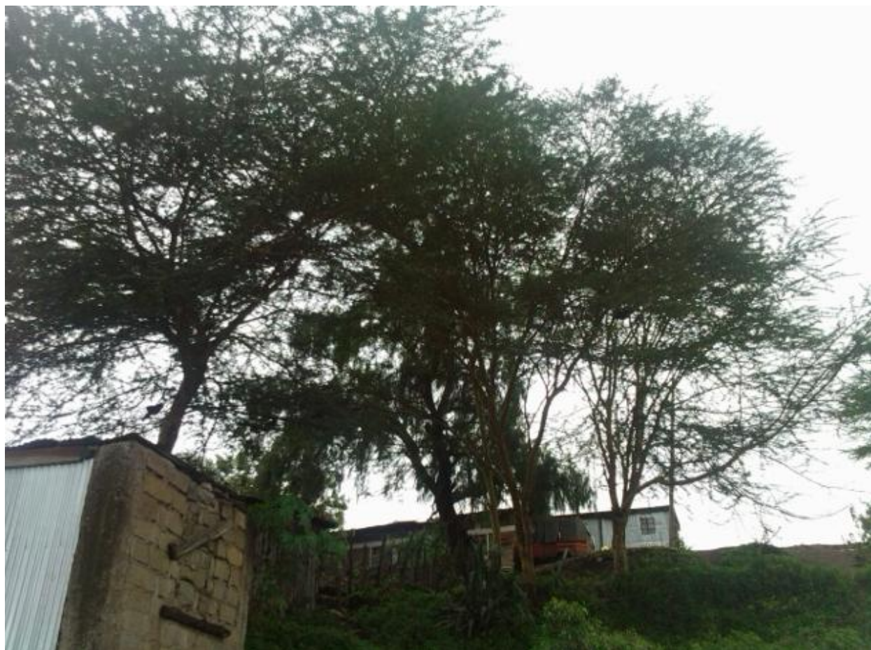
Figure 3. Catherine's picture of Acacia trees. (June 7 th , 2012). Her narrative reads, "These trees grow in semi-arid areas. They have roots, which go deep into the ground in search of water. When they grow near the riverbanks they can dry up the river leading to drought. On the other hand they are a source of fuel to many homesteads because the trees are burnt to produce charcoal."

The idea of cooking fuel was of high interest to the participants in terms of frequency of the pictures submitted. Here, Nina describes how jikos help to converse the environment because they use less firewood than other types of wood-burning stoves. Through the use of photovoice, Nina shared her local knowledge on these stoves and how they can reduce the amount of deforestation from felling trees for firewood.