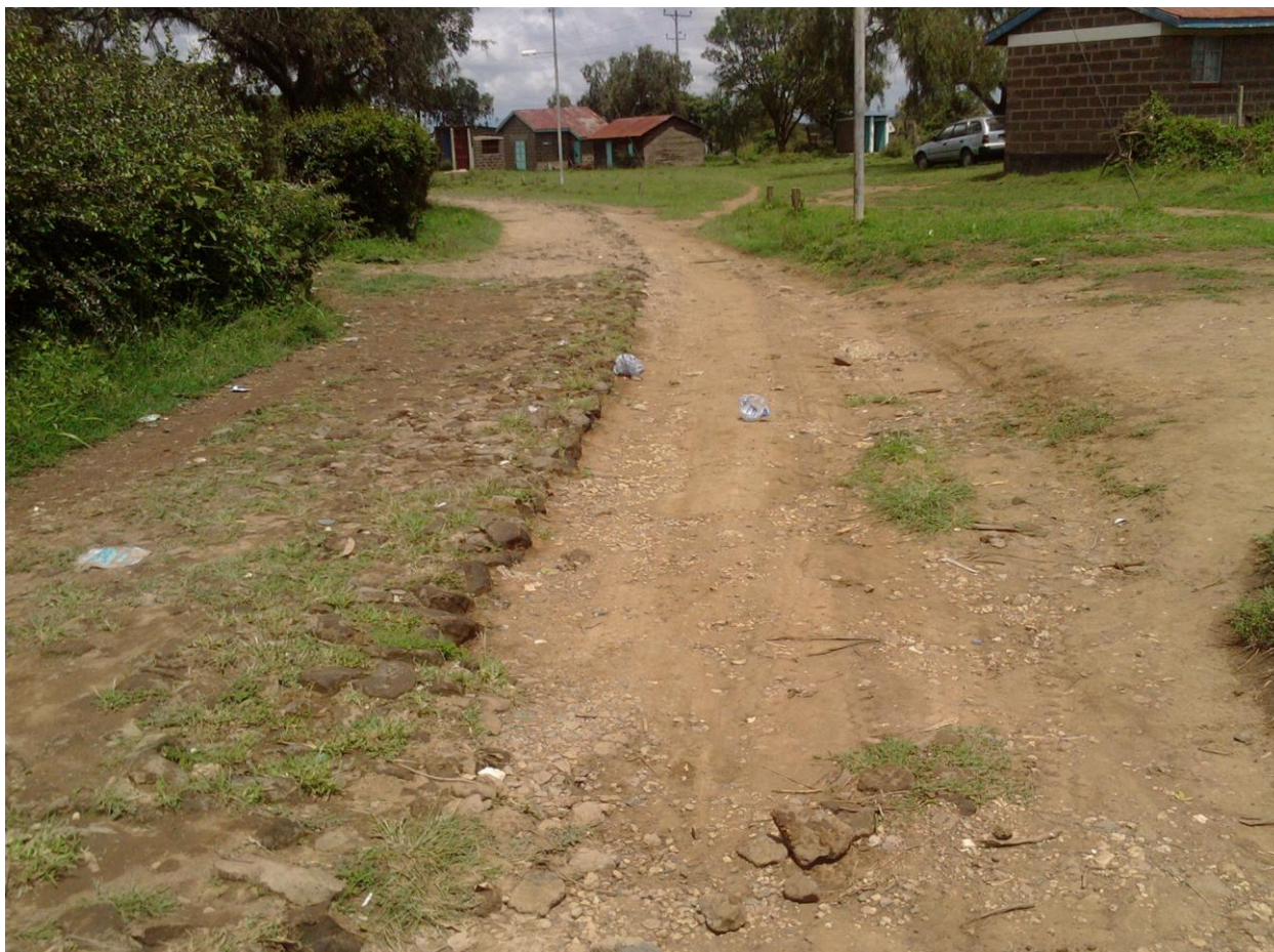
Figure 6. Jonas' picture of proper road maintenance. (June 26 th , 2012). His narrative reads, "I took a picture of proper road maintenance that controls soil erosion."

In a different way, David documents context when providing historical context to his picture. In this way, he is situating the context in a broader sense—a context that is dependent on understanding how the pastoral people of Africa have changed due to land adjudication practices and colonialism.