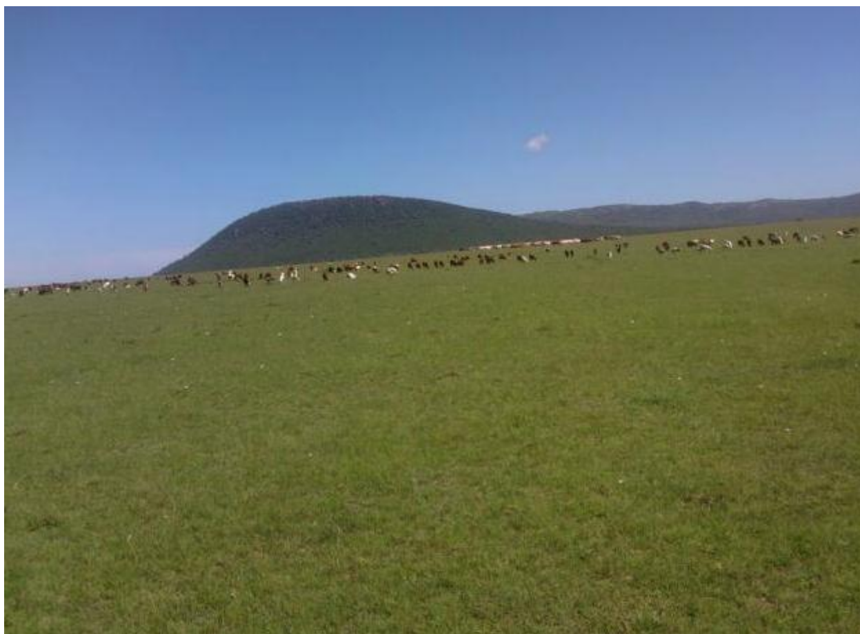
Figure 10. Mary's picture of overstocking (May 27 th , 2012). Her narrative reads, "I chose this picture because from it I learnt that overstocking can lead to environmental disasters as it results to overgrazing, which leads to reduction of vegetation cover hence rapid soil erosion which results to gulley. Soil erosion reduces crop yields. Reduction of vegetation cover leads to droughts, which in turn leads to mass deaths of wild and domestic animals. Man suffers a great loss as famines persist as a result of poverty and lack of food. Tourism activities also decline. As a result of poverty, crimes increases, which in turn might lead to civil wars making the earth, unfit to live."

In addition to viewing the participants' knowledge, this methodology afforded opportunities for the participants to document what is of critical importance to them.