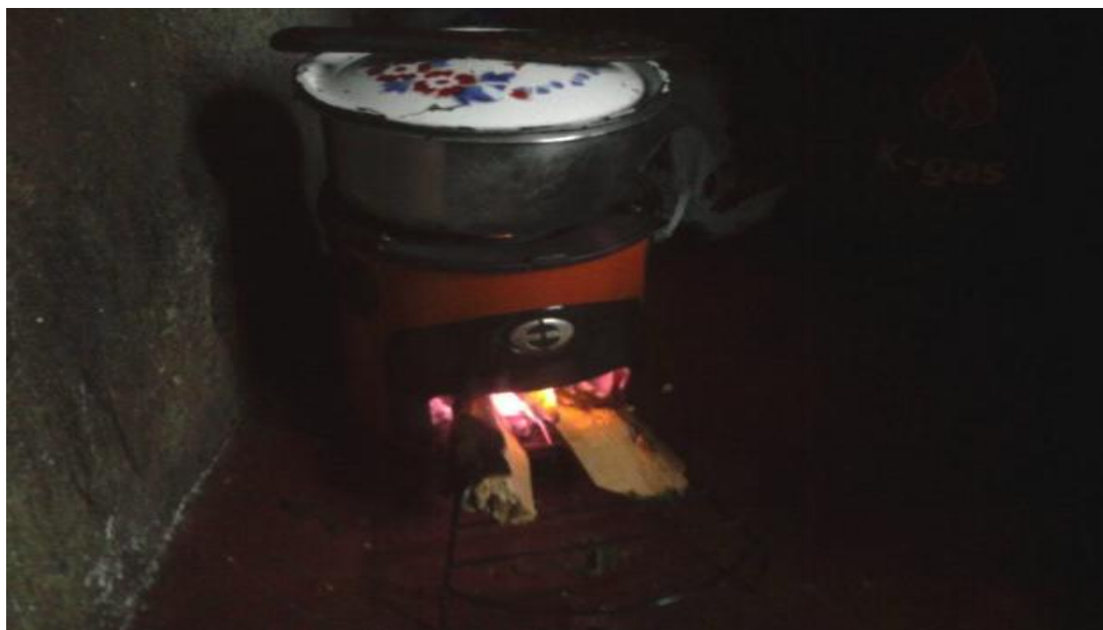
Figure 4. Nina's picture of a jiko (a stove that uses less wood than a typical wood-fired stove). Her narrative reads, "I got interested in this jiko because of its conservative nature. Since most people in Kenya uses firewood for cooking, this jiko uses very few pieces of firewood to cook hence avoiding felling down of trees thus conserving the environment."