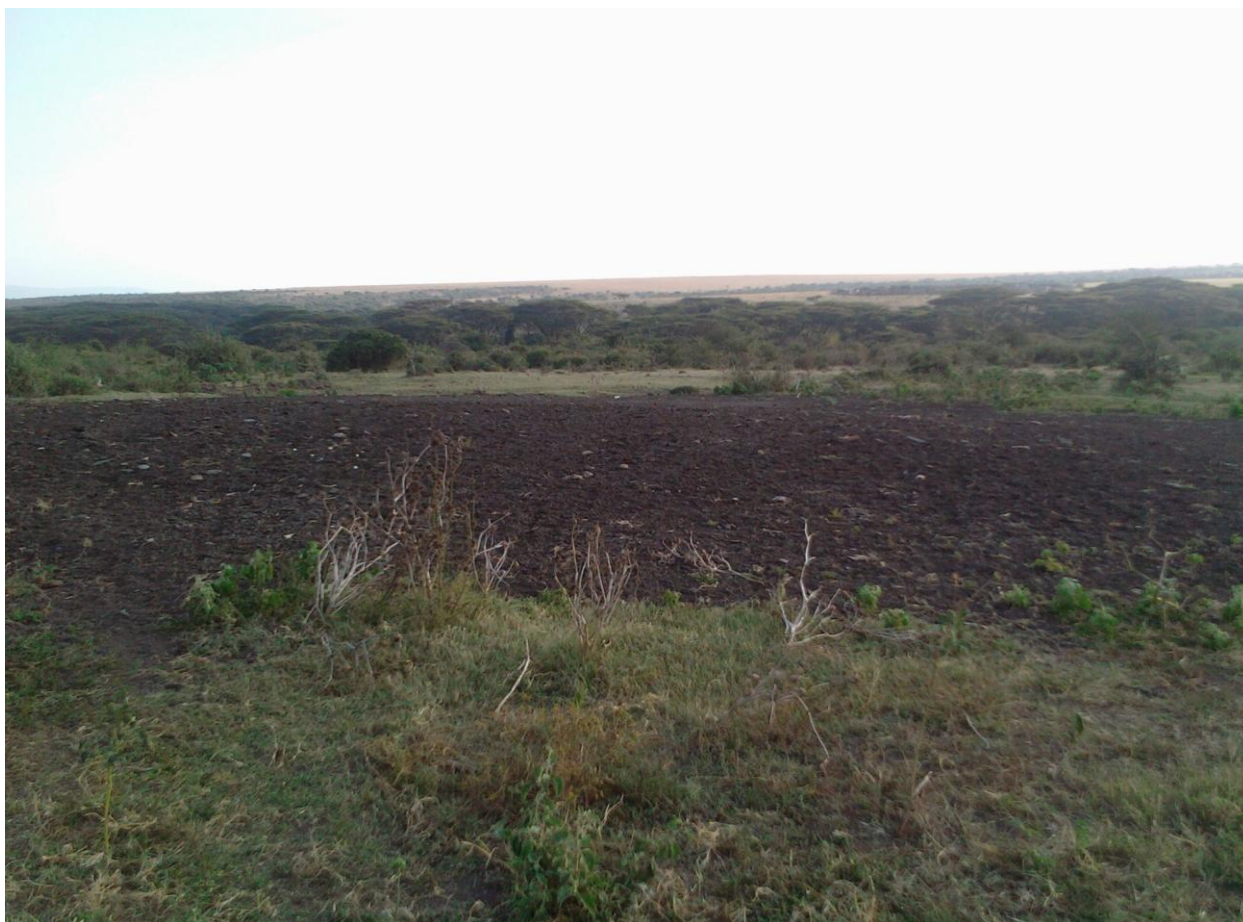
Figure 7. David's picture of cow dung (July 8 th , 2012). His narrative reads, "For hundreds of years, the movement of pastoral people across East Africa rangelands ensured a constant redistribution of nutrients. As seen in this picture, heaps of cow and sheep dung are deposited outside most homesteads for years due to families settling down following privatization of land. Most families have no idea that the heaps are full of minerals needed in pasturelands. Typically a grazing cow sheep or goats goes out into the plains and for 8 hours eat leaves and grass. Upon chewing, the dung is deposited in the kraal and later swept outside to sit idle for years. By doing so, and unknown to many, the drylands are becoming poorer and unable to support the pastoral people."