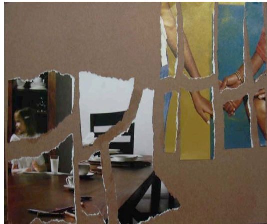
Figure 7. Elementary Education Student Collage Two

precious time in isolation waiting for a call from my love away I am randomly eating time with students teachers touching I find myself accepted