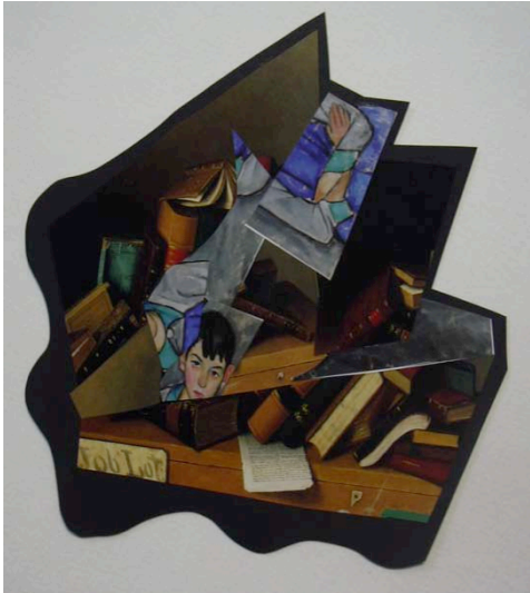
Figure 6. Elementary Education Student Collage One

Touching taught practice into theory through the lives of students people don't understand normalcy sleep in isolation mentored by my teacher family boyfriend alone