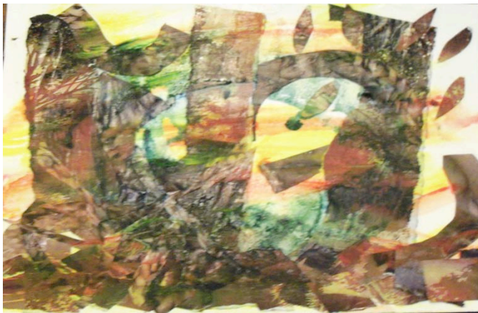
Figure 3. Sarah Collage

Answers disrupted in the messiness of being (im)perfect human teacher We yearn for straight answers drawing lines that become jagged in our grasping