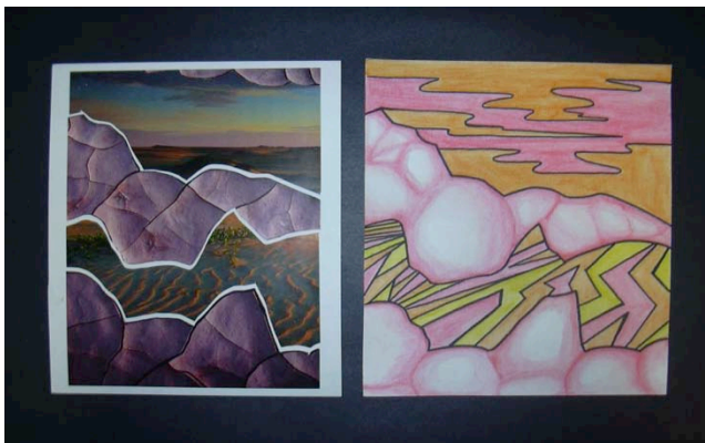
Figure 5. Art Education Student Collage Two

Isolation and touching similar in terms of subject matter Different perspective and meaning