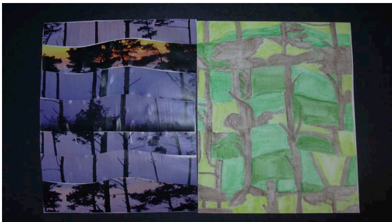
Figure 2. Mary Collage

Mixed media work represents my understanding Isolation touching and education on the left three different images trees pieced together in sequence I honor students, individuals vital