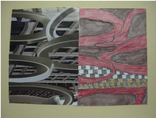
Figure 4. Art Education Student Teacher Collage One

Images, buildings a new city isolation in culture I feel very small Touching Images Ceramic bowls, plates, pitchers