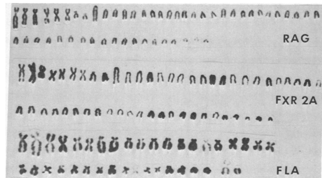
FIG. 1. Karyotype of FLA, RAG, and F × R 2A hybrid between RAG × FLA.