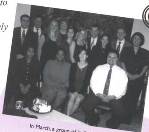
In March, a group of individuals who participated in Medical Mission 2000 to Guatemala coordinated an insightful two-hour presentation for various faculty and personnel from the College of Osteopathic Medicine and the Health Professions Division. The mission participants shared their experiences with the attentive audience via a slide presentation narrated by both students and faculty members.