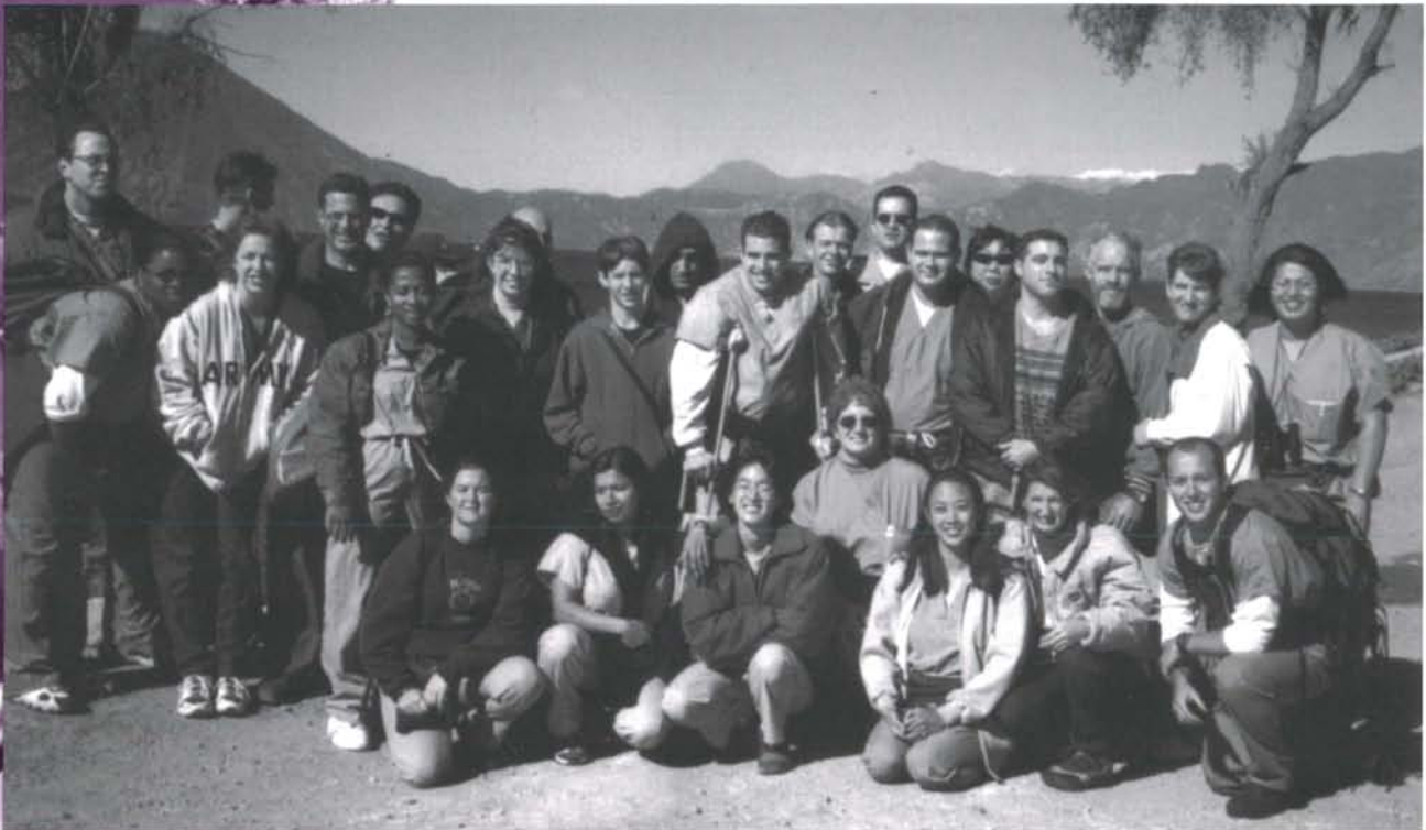
Medical Mission 2000 to Guatemala proved to be an enriching experience for the participants, who took pride in attending to the health care needs of over 800 Mayan villagers.