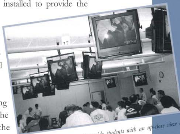
High-resolution TV screens provide students with an up-close view of manipulative techniques.

These upgrades clearly position the OPP teaching laboratory at the forefront of teaching facilities in the osteopathic profession. Future plans include the purchase of additional anatomical models and further enhancements to the AV system.