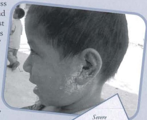
Severe cases of eczema were one of the most frequently diagnosed ailments during the 10-day medical mission.