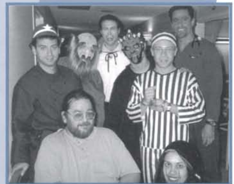
NSU-COM students pay a frightful visit to patients at the North Broward Rehab and Nursing Center.