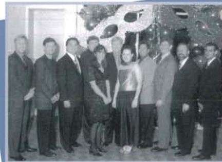
Class of 1990