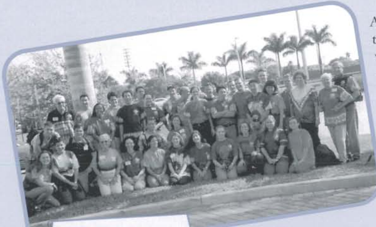
Medical Mission 2001 to Guatemala participants pose for a group shot before embarking on their humanitarian effort.