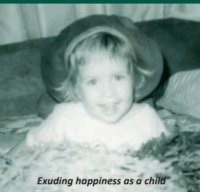
Exuding happiness as a child