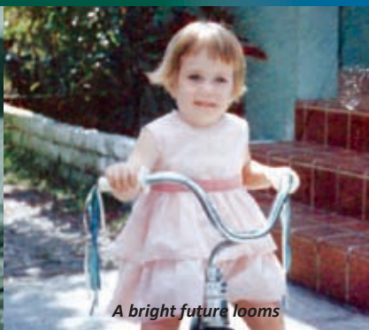
A bright future looms