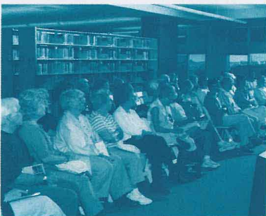
Guests filled the presentation areas for the panel discussions and author readings.