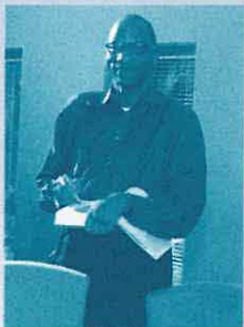
Author Wil Haygood autographs his book for a book lover.

English professor at both the University of Louisville and with Vermont College's M.F.A. in writing program. Naslund talked about her latest historical novel, Four Spirits , a semi-autobiographical book set in her hometown of Birmingham, Alabama, during the height of the civil rights era.