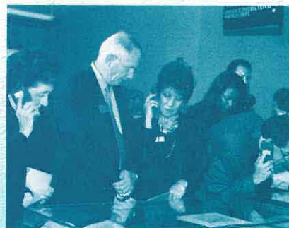
Visitors to the exhibit used state-of-the-art equipment for the audio tour.