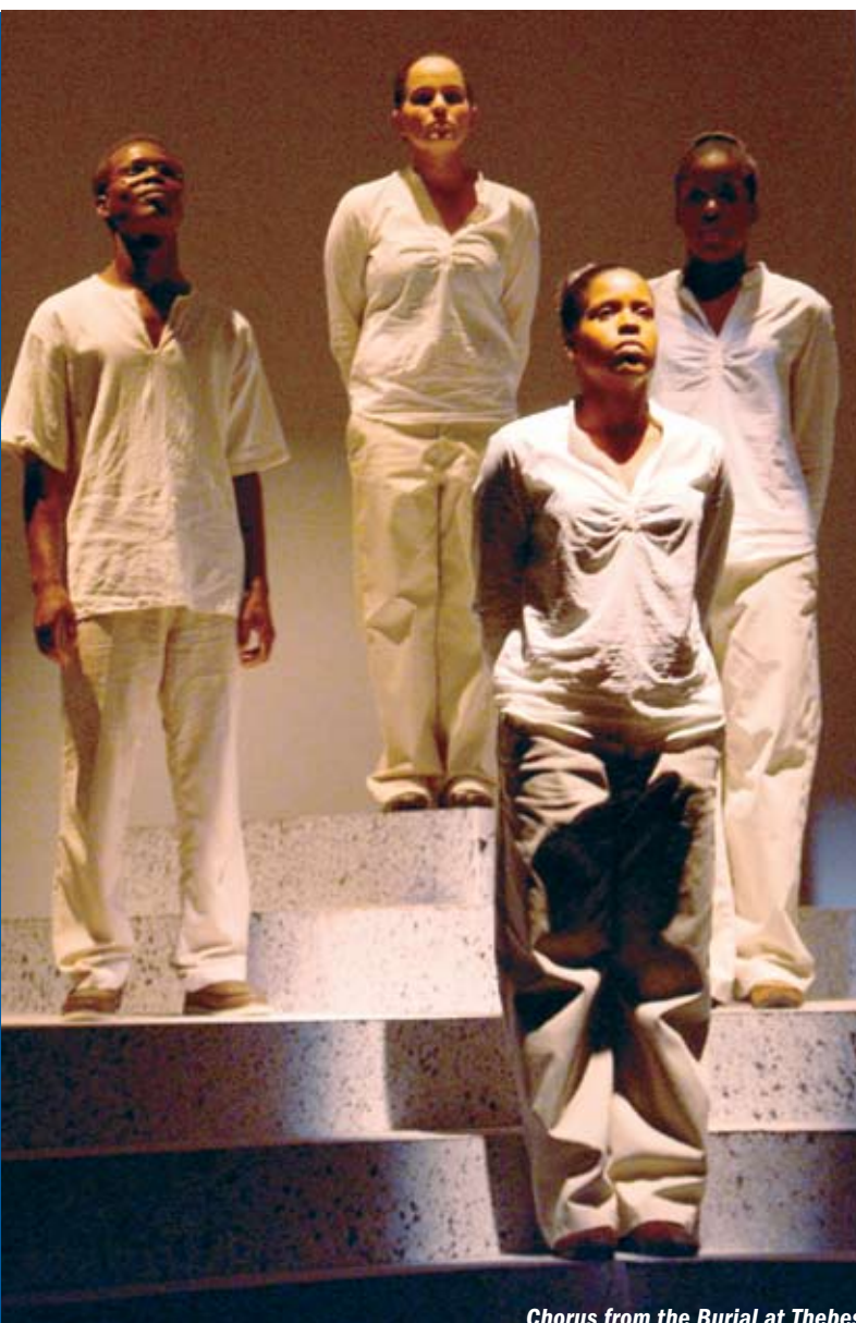
Chorus from the Burial at Thebes

NSU Theatre is planning four productions in the 2006–2007 academic year, including William Shakespeare's A Midsummer Night's Dream in the fall.