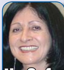
Judith Ortiz Cofer

Confronting prejudice and discrimination