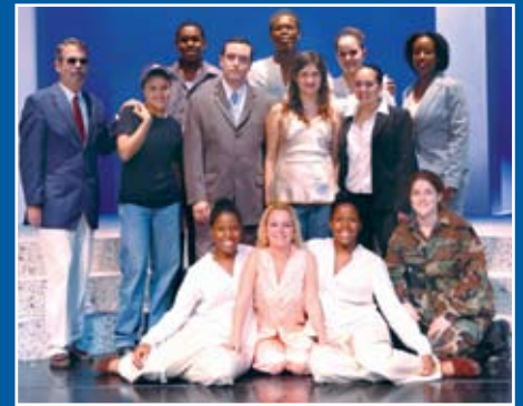
The cast of The Burial at Thebes