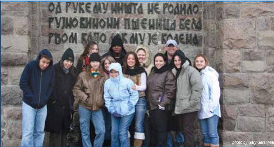
The site of the 14th-century Field of Blackbirds battle in Kosovo