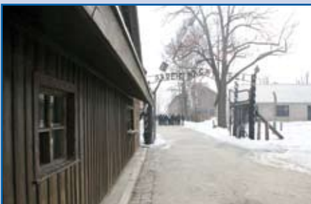
The entrance to the Auschwitz concentration camp