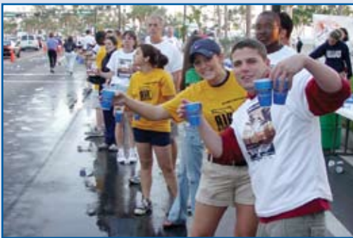
Students from the Athletic Training Education Program hand out water and encouragement to runners in the A1A Marathon.

The Farquhar College of Arts and Sciences launched a significant collaboration in February through the inaugural A1A Marathon, Broward County's first large-scale marathon. More than 2,000 runners participated in the event's full and half marathons. The college joined government, corporate, and media sponsors to create a signature event for the South Florida community that will continue as a major athletic weekend in the years to come.