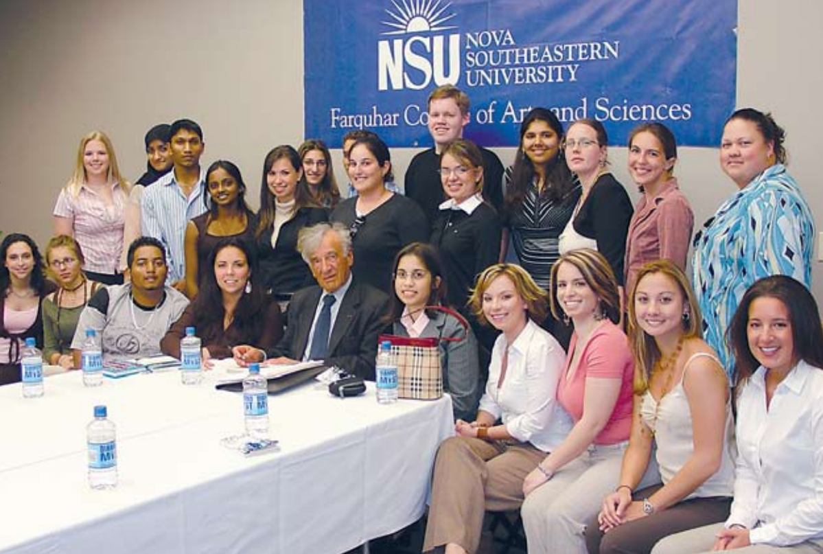
Elie Wiesel met with students on the main campus in February.