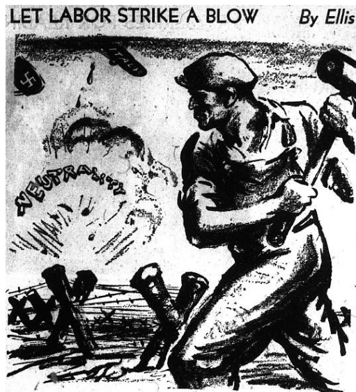
Figure 2: With German and Italian intervention revealing neutrality policies to be a sham, workers were implored to support their imperiled counterparts in Spain. (Daily Worker, October 10, 1936. Reproduced with permission, Tamiment Library, New York University.)

die spirit.” The same issue carried a report of a demonstration in New York’s Union Square in support of the Spanish people and against the US neutrality policy, as well as a political cartoon depicting a worker wielding a hammer while German and Italian warplanes drop bombs on “neutrality” (Figure 2).