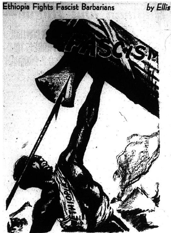
Figure 5: The Ethiopian struggle against Italian Fascist aggression was among the factors attracting African Americans to the loyalist cause in Spain.

Whether white or black, Jewish or gentile, worker or student, revolutionary or liberal, each of the approximately 2,800 Americans who left home to fight with the Spanish loyalists doubtless had his or her own reasons for making that decision. What they had in common, however, was a conviction that events in Spain were of universal human significance and that the defeat of fascism was a necessary prerequisite to creation of a world in which they would wish to live. For at least two of every three of those American volunteers, that aspirational world was a collectivized one on the model of what some knew, but most only imagined, existed in the Soviet Union under the