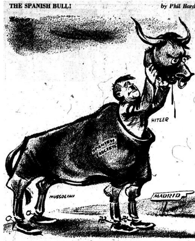
Figure 1: The international implications of the war in Spain, and specifically the relationship between the rebel side and the fascist governments of Europe, were important themes of coverage in the communist press from the beginning. (Daily Worker, August 10, 1936. Reproduced with permission, Tamiment Library, New York University.)

As discussed in Chapter 2, the People's Front policy of the Comintern was first applied in France and Socialist Premier Léon Blum, head of the liberal-left government there, clearly wished to aid his sister government in Spain. At a cabinet meeting in Paris on August 1, Blum argued that France not only had an obligation to extend help to the Spanish Republic, but that it was also in its self-interest. It was at that point, however, already evident that the more conservative British government would not follow suit and would not back France should a general war result from its intervention in Spain. In that circumstance the more cautious members of the French cabinet prevailed in obstructing