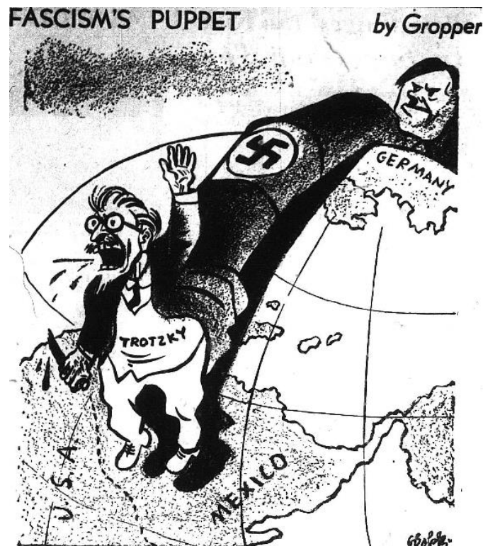
Figure 3: The challenge to Stalin’s policies represented by Trotskyism was portrayed as serving the interests of fascism, and even of being a component of fascist international strategy. (Daily Worker, February 8, 1937. Reproduced with permission, Tamiment Library, New York University.)

old Bolshevik[;] we shall destroy his whole kith and kin. Anyone who encroaches on the unity of the socialist state in action or in thought, yes, even in thought, will be mercilessly destroyed.” 9 As would be evident in Spain, juxtaposition of People’s Front anti-fascist unity with Great Terror anti-Trotskyite sectarianism only appears paradoxical if one fails to discern their common underpinnings.