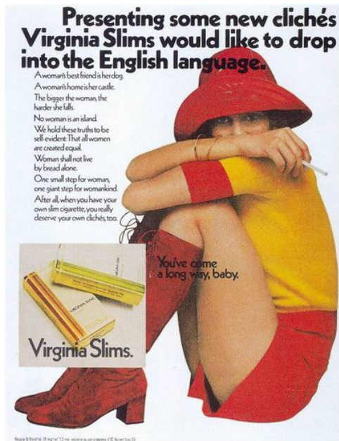
Figure 3. 1970s ad for Virginia Slims. The “post-feminism” female of the 1970s.