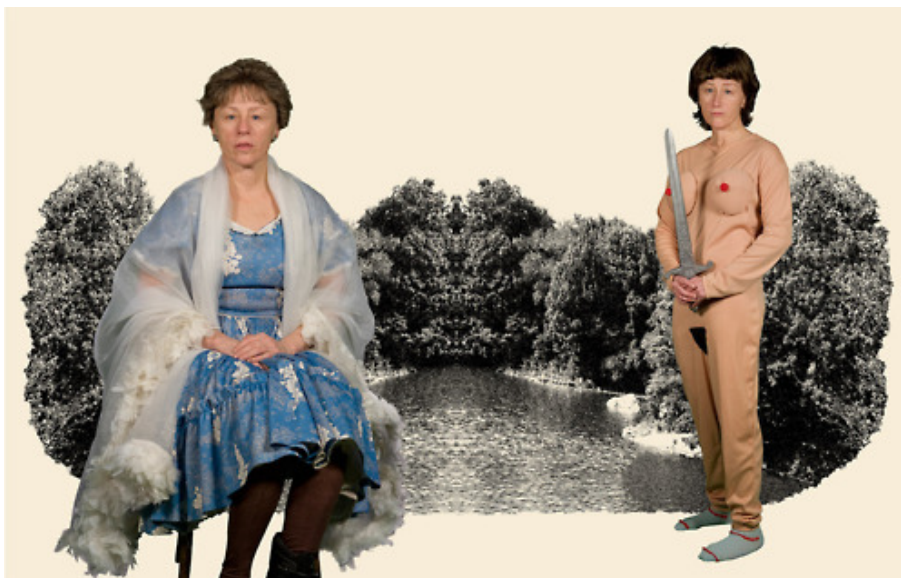
Figure 19. Untitled , Cindy Sherman, 2010.