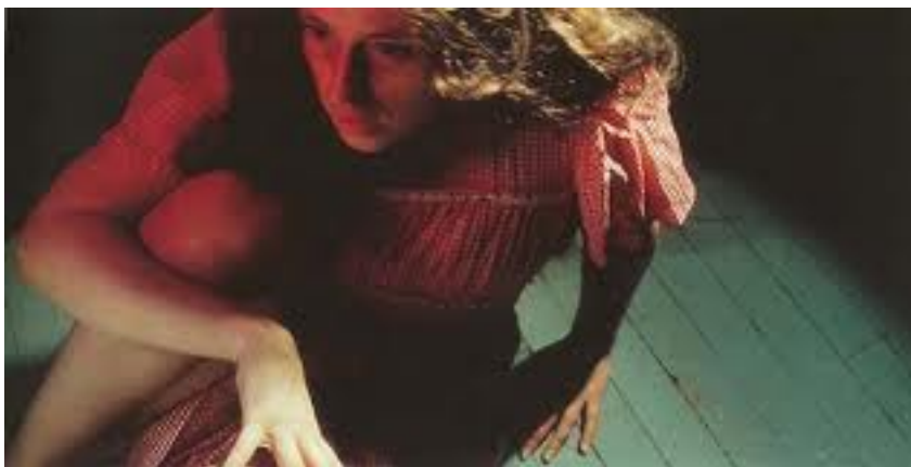
Figure 14. Untitled #85 , Cindy Sherman, 1985.