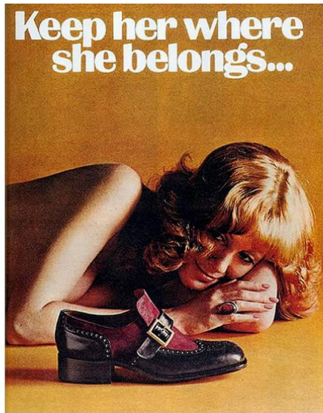
Figure 1. The now infamous Weyenberg shoe ad.