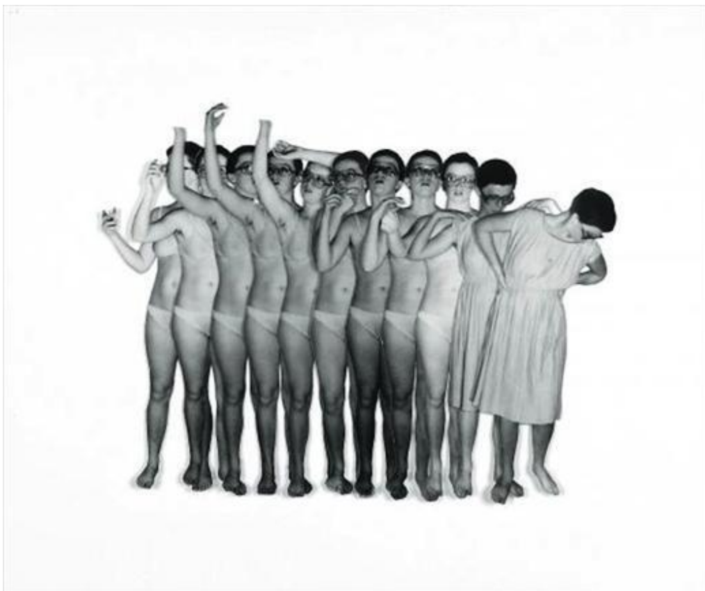
Figure 4. From Doll Clothes , Cindy Sherman, 1975.