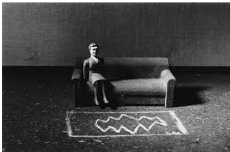
Figure 12. Interior VIII/ Woman , Laurie Simmons, 1976.