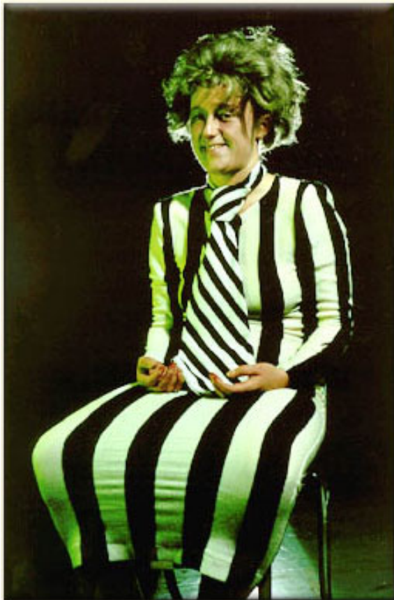
Figure 15. Untitled #138 , Cindy Sherman, 1984.