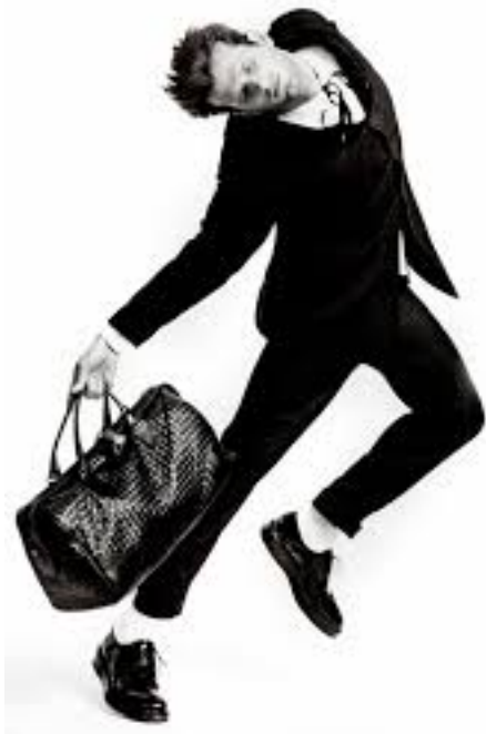
Figure 13. Bottega Veneta Ad campaign, Robert Longo, 2010.