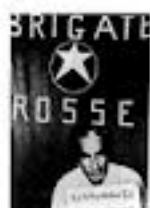
Figure 11. April 21, 1978 (detail), Sarah Charlesworth, from Modern History series, 1978.