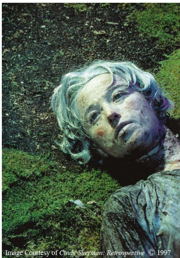
Figure 18. Untitled #153 , Cindy Sherman, 1985.