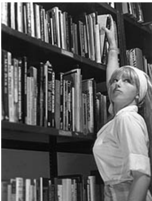
Figure 5. Untitled Film Still #13 , Cindy Sherman, 1978.