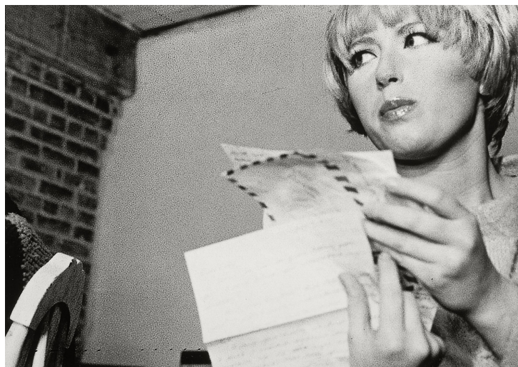
Figure 6. Untitled Film Still #5 , Cindy Sherman, 1977.