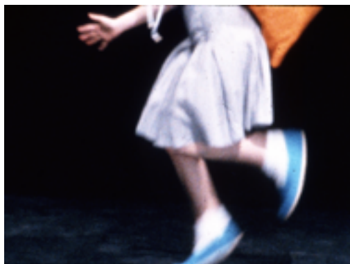
Figure 7. We Imitate, We Break Up (still), Ericka Beckman, 1978.