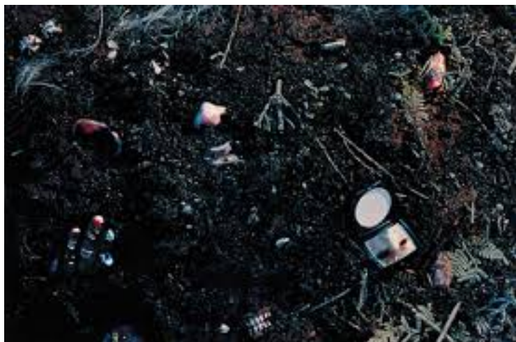
Figure 17. Untitled #167 , Cindy Sherman, 1986.