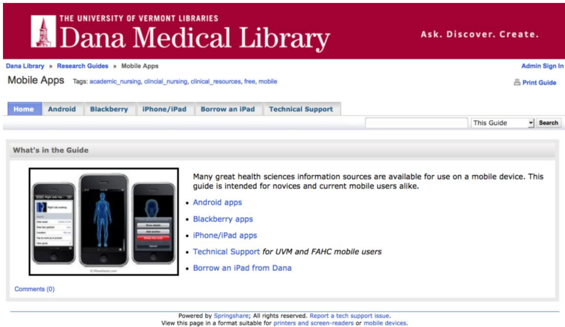
Figure 1. Online subject guide

Figure 2 depicts usage statistics from LibGuides showing the variation in traffic to the mobile subject guide throughout 2012. Use of the subject guide in March, when the mobile instruction session occurred, was 218% higher than the previous month. Average use of the guide remained measurably higher in the six-month period following the class.