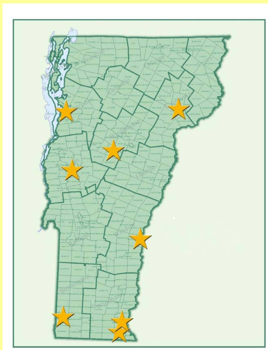
Figure 1 – There are at least 9 crematoria dispersed through the state of Vermont, which each perform between 300 and 1,000 cremations per year. Eight locations are shown here.