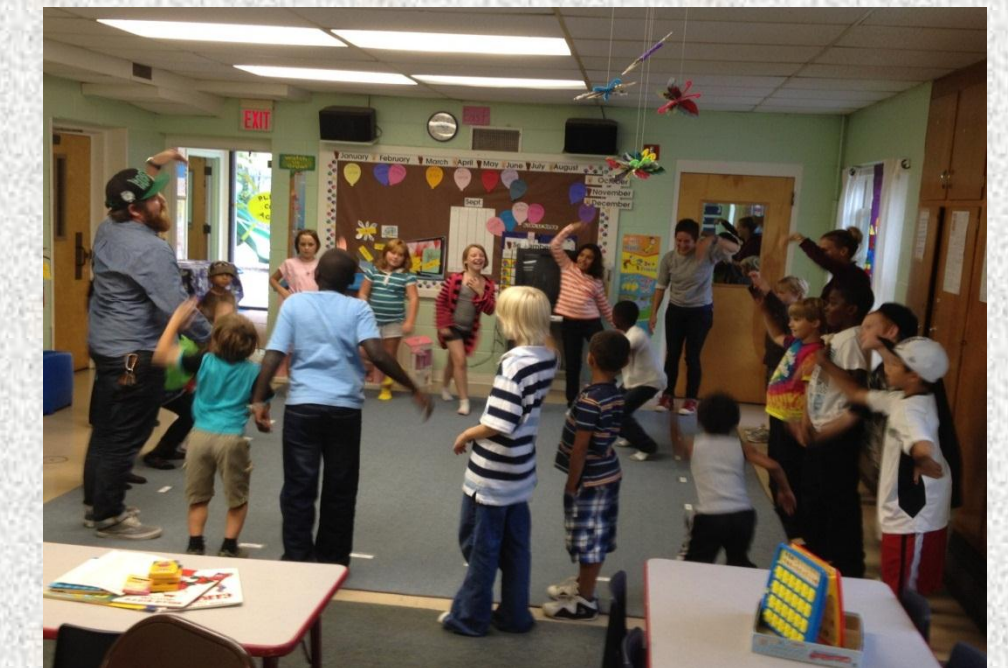
Afterschool participants during "Circle Time"

We created and administered a 21 question interview in a semi-structured format to the 6 staff members. Each interview was recorded, transcribed and rendered anonymous. From these transcripts, we conducted a qualitative needs assessment and identified 4 themes. We highlighted strengths and challenges for each category and developed recommendations to address these challenges.