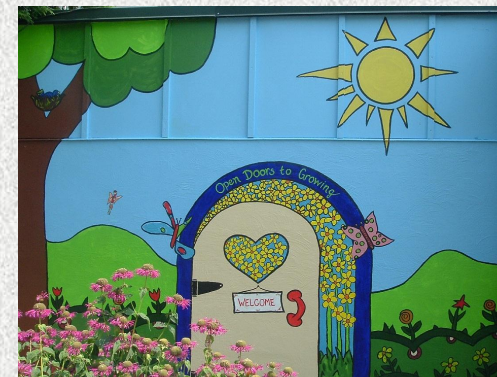
Mural outside SHCC

"...to have a place that is very safe and gives them a sense of safety and fun, it just goes a really long way."